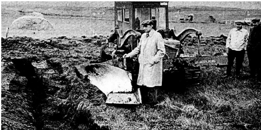
Figure 3. Ploughshare made from steel plates of WWII warship Tirpitz. Inventor: R. Skjærpe, an ingenious entrepreneur living in Jæren, Norway. Picture from 1951 [25].

The situation for the decommissioning and removal of wrecks may be different, as wrecks have to be broken at the site in case it is impossible to remove them. In Norway, we were reminded of the Biblical verse: “They shall beat their swords into plowshares” [24], when the steel plates of the warship Tirpitz were made into very powerful ploughshares [25] (Figure 3), in the years after World War II.