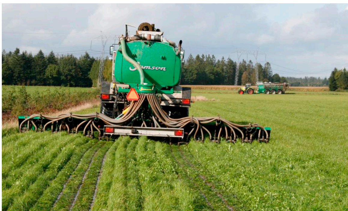
Figure 1. Modern equipment for spreading/molding down of manure and animal urine.

Farmers are specialists in recycling, as they dispose of manure and urine from animals. The technology for saving the nitrogen in the manure and urine has been much improved during recent years with the introduction of equipment that forces the fluid into the ground under pressure (Figure 1). Through this method, which is very efficient, though expensive, climate gas emissions are reduced and the smell (which is irritating for dwellers) becomes of less concern. For a discussion of the benefits, see Reference [15].