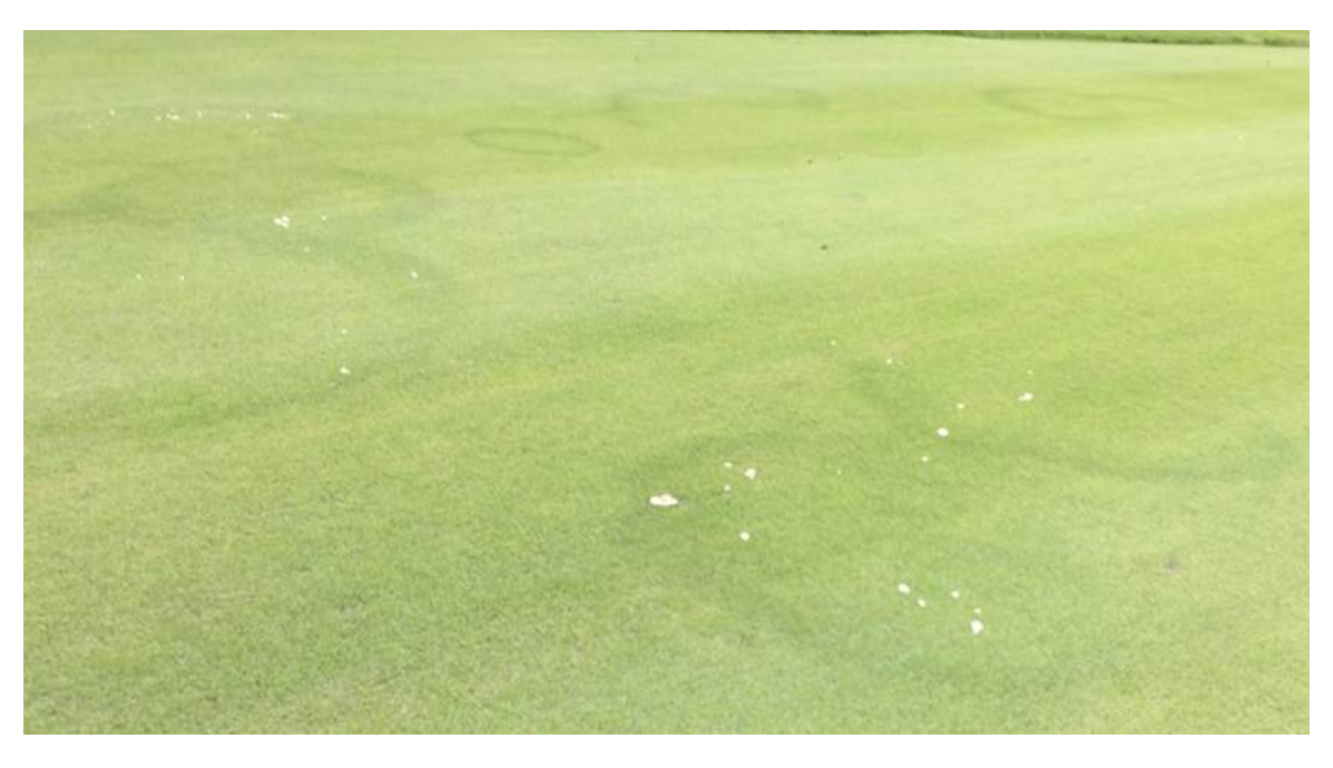
Figure 1. Fairy rings appearing on golf course grass.

(FCs) after the title of the article in Nature that covered our study [8]. Subsequent studies have demonstrated that FCs endogenously exist in all the plants tested, including edible parts of three major cereal crops, rice, wheat, and corn [7]; thus, people have eaten FCs for a long time. Furthermore, FCs increased the yields of rice, wheat, and other crops under field and greenhouse conditions [5,9,10]. These results suggest that FCs are a new family of plant hormones [11,12].