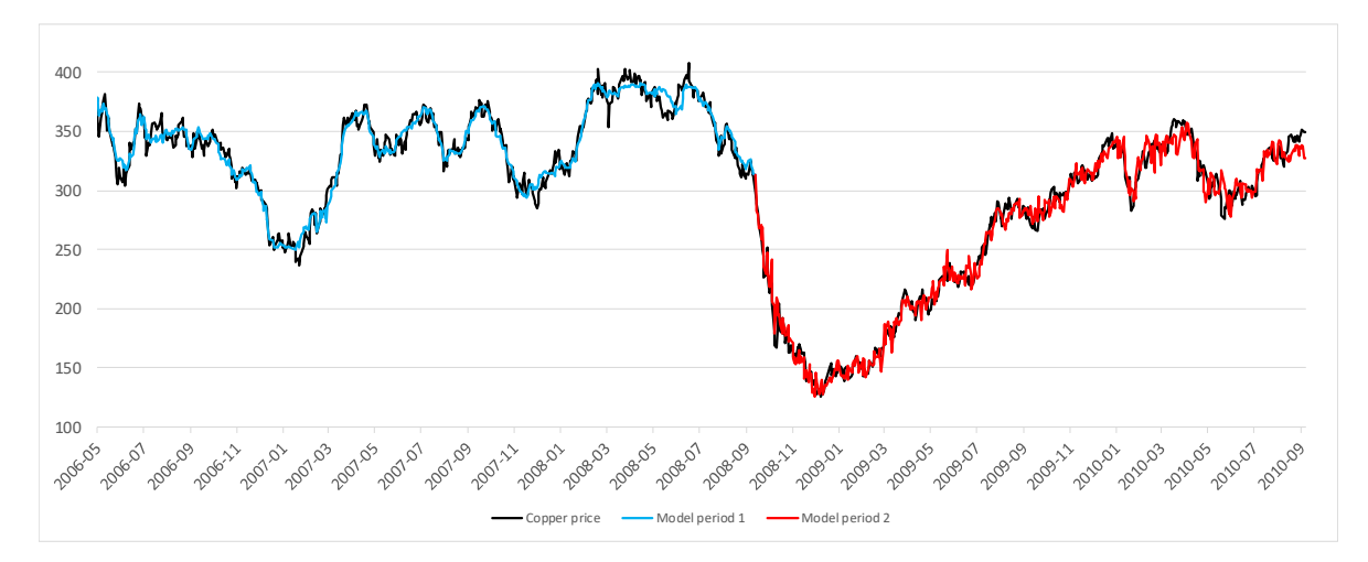
Figure 2. Comparison between the model outputs and the copper prices.

In both periods, the MLP net structure outperformed the others, with MAPE smaller than the 4% obtained by [49], and correlations with the original series were in the order of 98%, almost 9% higher than the correlation of 89% of the MLP proposed by [41]. The adjustment between the selected models for each period and the copper prices is depicted in Figure 2.