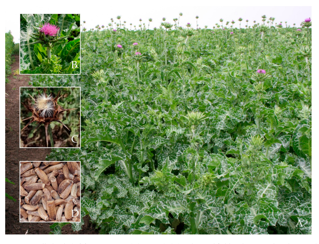
Figure 1. Milk thistle ( Silybum marianum (L.) Gaertn). ( A ) Cultivated field at the Agricultural Research and Development Station (SCDA) Secuieni, Neamț County, Romania. ( B ) Flower head with spiny bracts and variegated leaf. ( C ) Mature flower ( D ) Fruits.

MT-based food supplements are available in a variety of pharmaceutical formulations, including pills, tablets, capsules, or standardized extracts, and can be bought at pharmacies and over largely uncontrolled distribution channels, such as e-commerce platforms [3,18,19]. With attracting claims on their purported health benefits, food supplements are used by consumers with the hope of maintaining their health or supporting specific health conditions. Studies show that up to 43% of patients with liver disease and up to 87% of patients with cancer use hepatoprotective herbal-based food supplements, including MT [20]. The high popularity is spurred, among others, by the consumers' misconception that botanicals are "natural" and, thus, always "safe" [21]. This assumption and pervasive misleading advertising and poor quality of marketed preparations may lead to serious threats to the consumers' health and well-being, beyond limitation in reaching the expected beneficial effects.