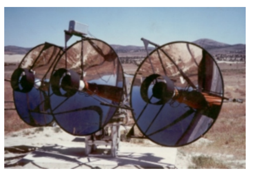
Figure 2. One of the Durham Mark I telescopes situated at Dugway Proving Ground, Utah in the USA.

The Mark I telescope mirrors were army-surplus searchlight mirrors, much like the mirror used by Jelley and Galbraith for the first atmospheric Cherenkov detector [6], but larger (1.5 m diameter). The optics were not ideal, so they were improved by the use of a secondary Cassegrain mirror system—dual-mirror Cherenkov telescopes are not so new after all. The Mark II telescope departed from this design; there were still three reflectors, but each consisted of seven custom-built mirrors with more suitable 250 cm focal lengths made from machined and polished aluminium. A 3-inch (7.5 cm) PMT was placed at the focus of each reflector.