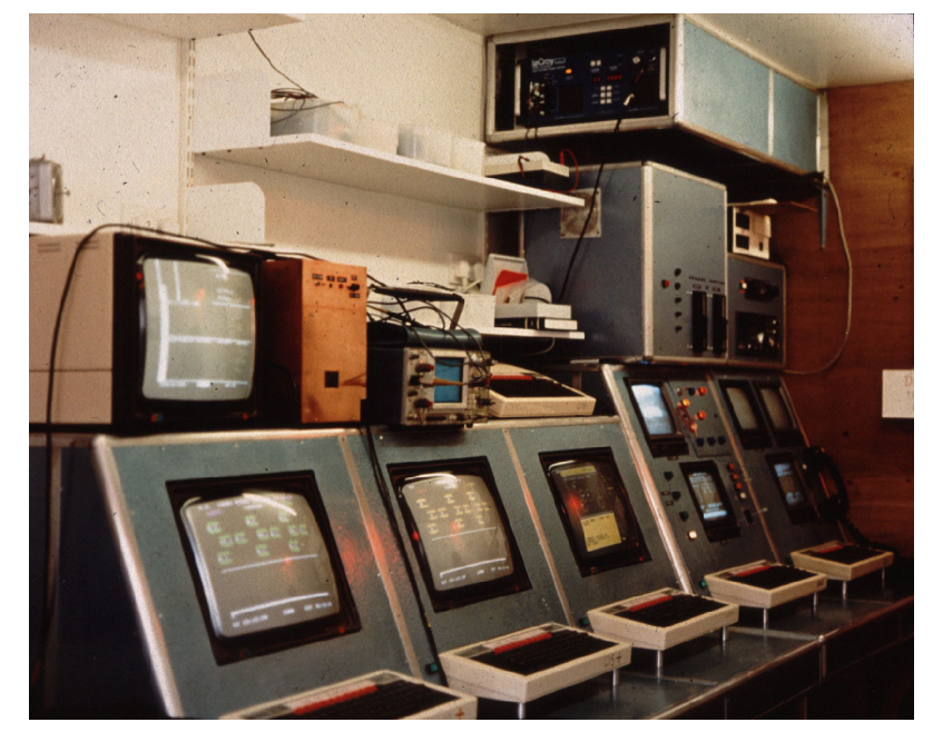
Figure 4. The Durham Mark III telescope control room. While the main DAQ was performed by a Motorola 68000 computer situated under the console, the system's interfaces were all BBC microcomputers. These were remarkable- and remarkably cheap-computers for their time. The copper box on top of the console contains the rubidium oscillator used for timing.

Figure 3. The Durham Mark III telescope under construction in Durham, with about 75% of the mirrors in situ. Note the snow on the ground! It is also possible to see the edge of the Mark II telescope at the bottom right, which was rebuilt in Durham for test purposes.