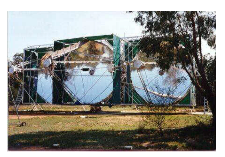
Figure 5. The Durham Mark 6 telescope in Narrabri, NSW, Australia. The telescope was around 20 m from end-to-end.

The Mark 6 telescope comprised 3 parabolic reflectors on a single mount, once again consisting of a honeycomb structure with an anodised aluminium skin, but this time formed into triangular sectors, so that a continuous reflective surface was created. These were too large for a vacuum chamber, but the relatively small sagitta of the mirrors, mostly in one direction, meant that it was possible simply to stretch the surface over the mould. However, we had probably reached the limit of the possible image quality with the anodised aluminium skin. Although malleable and durable, with excellent reflectance, there is a fundamental issue with the material that relates to the way it is manufactured. As a rolled material, there is an inherent directionality in the material and hence in the reflected light—the result had considerably diffuse reflectance in the direction in which the underlying aluminium had been rolled. Some batches were better than others, but the manufacturers did not know why. We seriously considered building aluminium-surface mirrors for H.E.S.S. at one point, but the company was not able to pursue any research into the reasons for the variations in quality without considerable financial input.