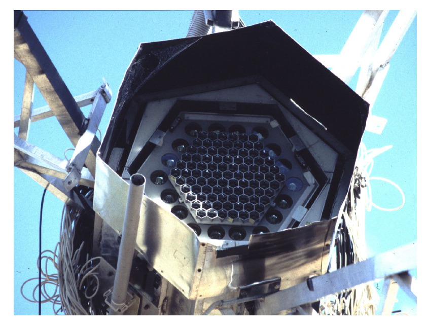
Figure 6. The Durham Mark 6 telescope's central camera.

The telescope was triggered via a coincidence between the central camera and corresponding PMTs in the lower-resolution left and right cameras. The camera trigger required that the left and right PMTs should be in the same region as at least 2 adjacent PMTs in the central camera. This trigger, devised by the ever-ingenious Lowry McComb, enabled the energy threshold to be lower than would usually be expected for a telescope situated not much above sea level, though I think not as low as the simulations suggested. Although there was no array trigger, once again, events from the Mark 6 could be correlated with those from the other telescopes on site, the 5A and 3A (a slightly upgraded Mark III), using the event timestamps.