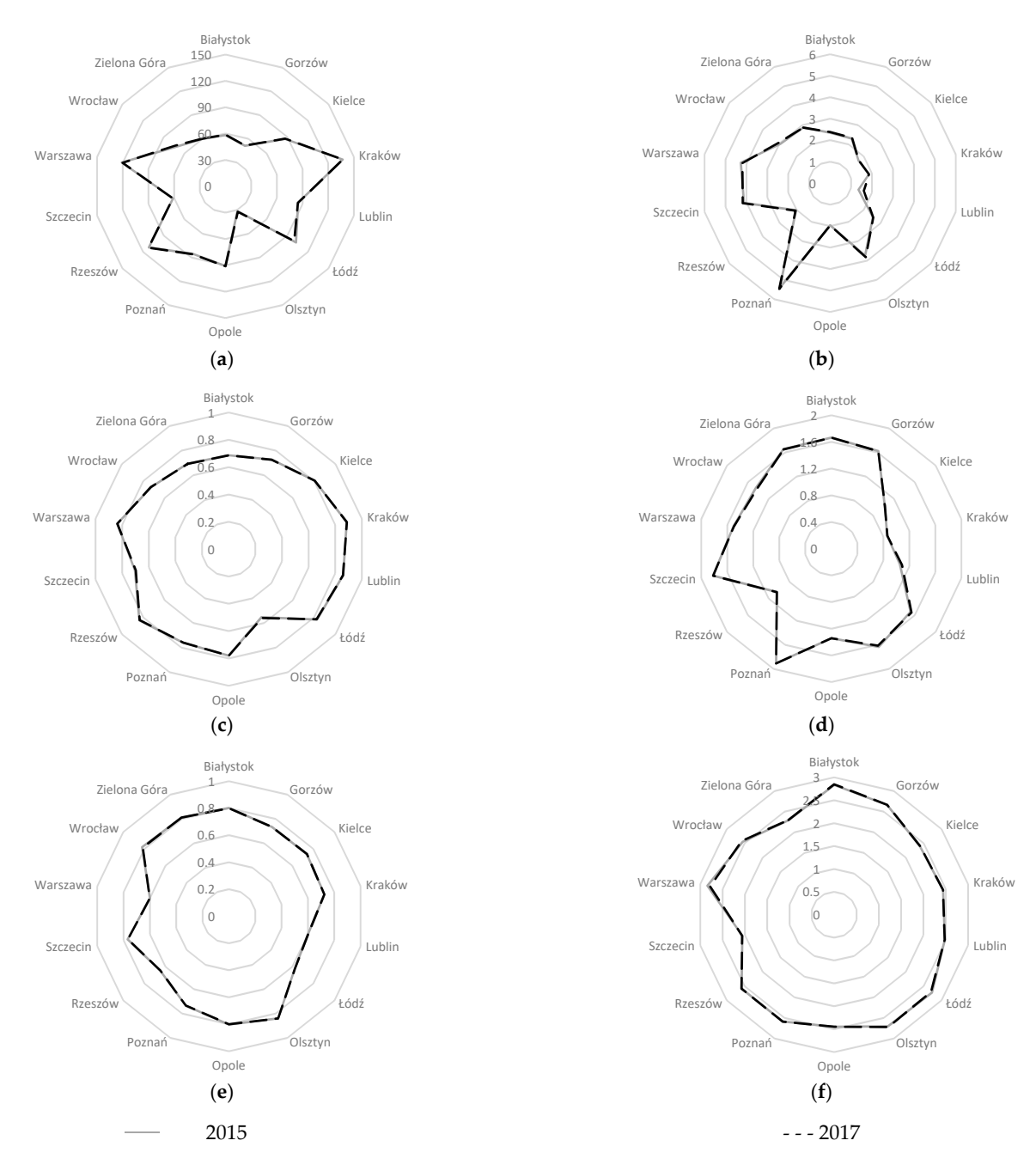
Figure 2. Values of morphological indicators for 2015 and 2017: (a) Density— D_{iu} ; (b) Urbanization pressure— UP(j\rightarrow i) ; (c) Continuity — C_{iu} ; (d)—Concentration— COV_{iu} ; (e) Clustering—CLUS<sub>iu</sub>; and (f) Decentralization—CBD(dist).