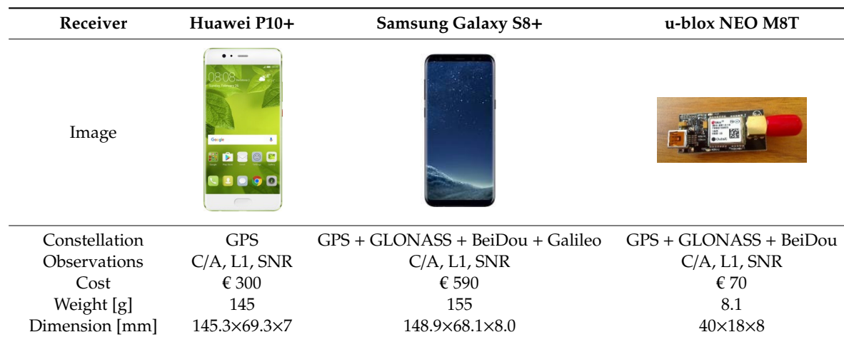
Table 1. The instruments used in these tests.

To generalize the results in terms of environmental conditions, two different test sites were investigated: the first test-site was one the rooves at Politecnico di Torino (Italy), an area where the noise and multipath effects are very high and where the satellite visibility is reduced due to the presence of other buildings. The second one was an open-sky site characterized by the absence of reflective surfaces, electromagnetic disturbances, and with optimal conditions for tracking satellites (e.g., no obstructions). These two sites, namely A and B, depicted in Figure 1, respectively, represent the two main conditions where a user works or tries to perform positioning activities.