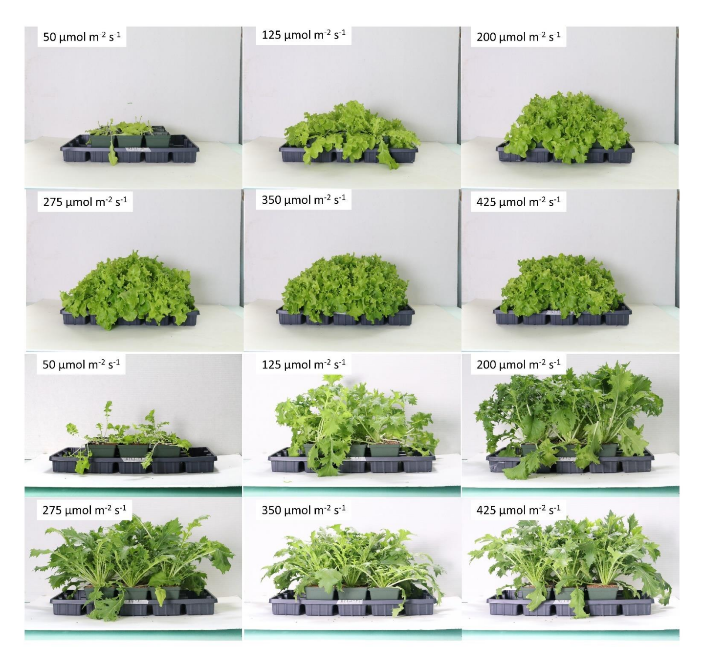
Figure S4. The appearance of lettuce ( Lactuca sativa 'Green Salad Bowl', top) and mizuna ( Brassica rapa var. japonica , bottom) at the end of the growing cycle for plants grown at six different photosynthetic photon flux densities (upper left corner of each picture).