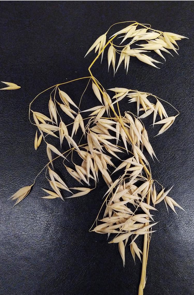
Image 1. An oat panicle