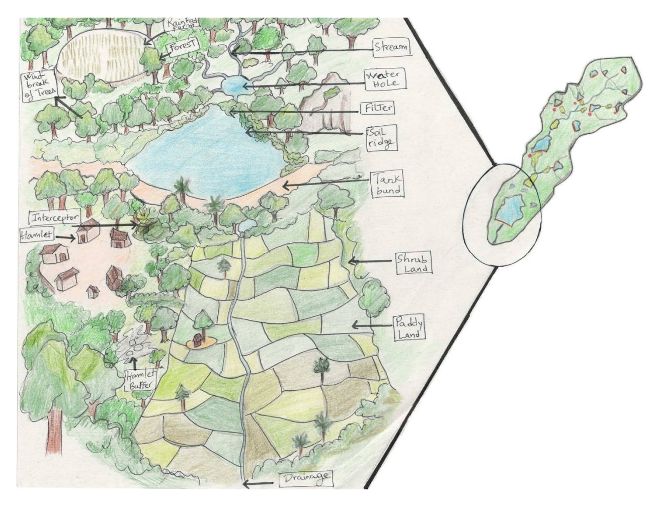
Figure 1. Main components of the tank.