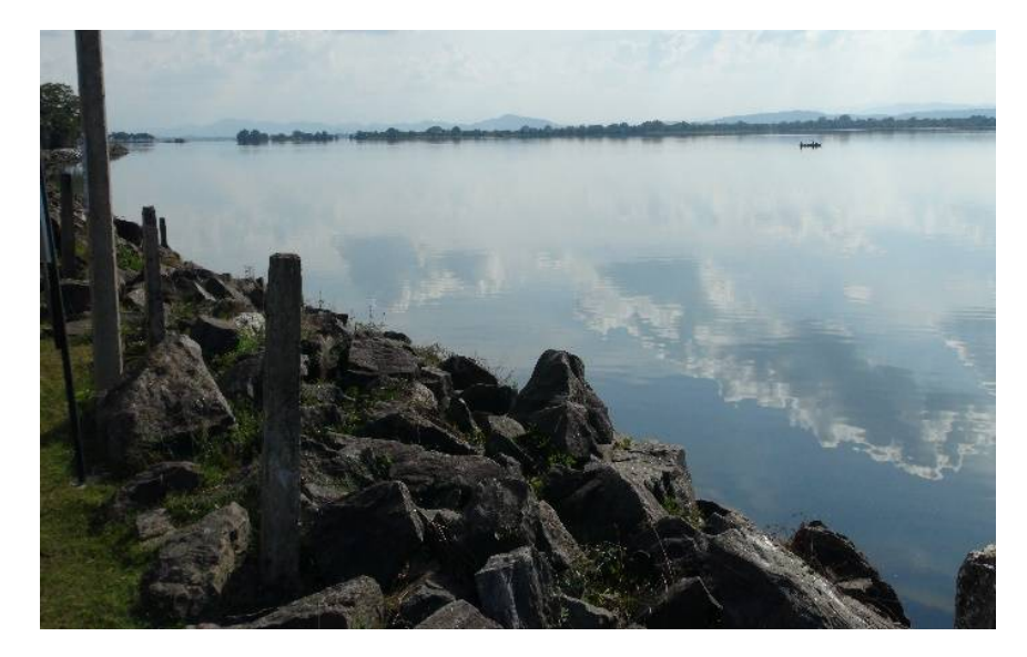
Figure 4. View of Parakrama Samudraya

In the reign of King Parakramabahu (1153–1183 AD), water management technologies were further refined [5]. His engineers built several large-scale tanks and irrigation systems [23]. They constructed more than 163 major tanks, 2376 minor tanks, 165 anicuts and 3910 diversion channels [51]. The capital was located in present-day Polonnaruwa city, about 50 km east from Sigiriya. King's palace was located very close to the tank called Parakyama Samudraya (Figure 4) that had nine-mile-long embankment. In order to protect the palace from floods, huge brick walls were constructed along the tank side of the palace. There were several non-structural natural drainage facilities inside the walls to temporarily store water. The ground was also covered with grass to reduce soil erosion and trap debris. A few sluice gates were installed along the brick walls. A drainage canal was installed in the other side of the palace. Kumara Pokuna near King Parakramabahu's palace was one of bathing ponds that might have functioned as flood control structure (Figure 5). Similar to the Anuradhapura pipeline system it was connected with several drainages to purify water [17]. Even today this system is functioning well.