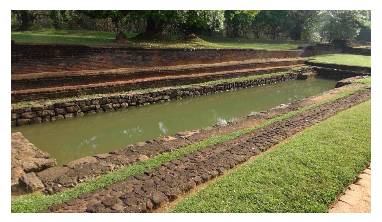
Figure 3. A water storage tank in the Sigiriya complex.

used to direct rainwater to the structural ponds located in lower elevations. During the process, water was filtered and velocity was reduced to control soil erosion [17]. Sigiriya also had water gardens and fountains [17,45]. The pools in the water gardens and Sigiriya tank were interconnected through underground drainage. This helped fill the pools automatically [8,42]. During the rain, the water garden can function as a water storage facility. In maintaining pools for bathing purposes, water was supplied from storage tanks, and the used water was released to moats through a separate drainage. The fountains were connected to special underground channels [42]. The moats were located in the lowest area of the land and excess water flows into the moats by reducing floods (Figure 3).