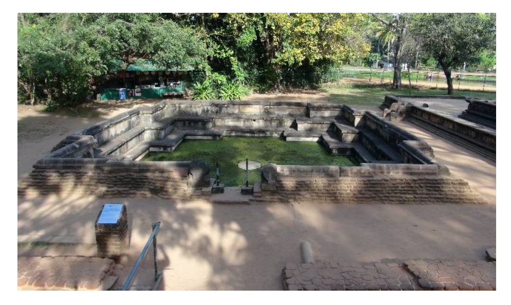
Figure 5. Kumara Pokuna in Polonnaruwa