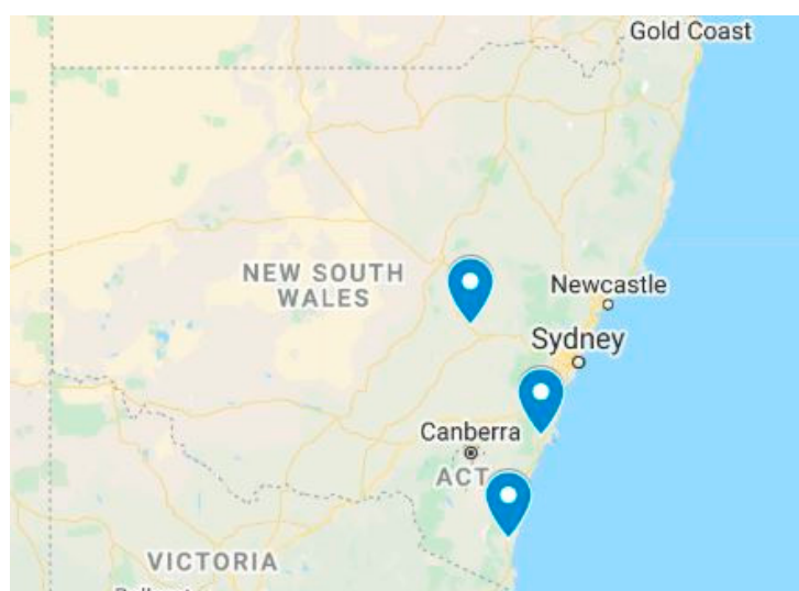
Figure 1. Geographical locations of three case studies in New South Wales, Australia.