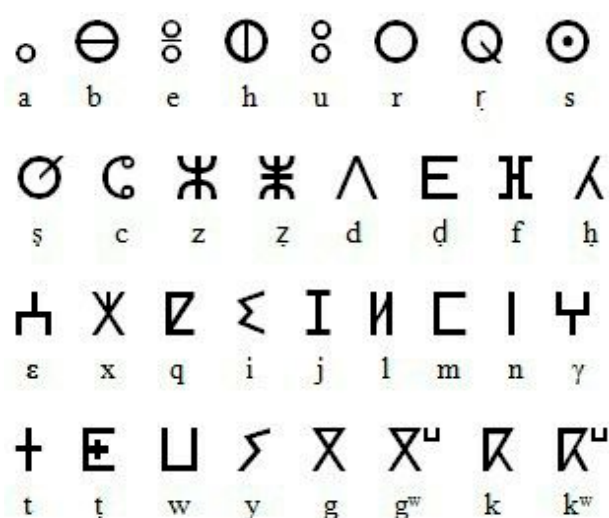
Figure 2. Tifinagh symbols and Neo-Tifinagh alphabet. The lowercase letters represent the orthography in Latin script with diacritics indicating specific Amazigh phonemes.