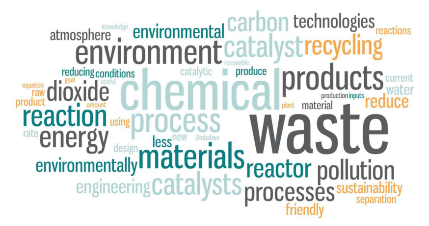
Figure 2. Visualization of the most frequent words used in the online discussion.

To determine if the participants incorporated sustainability concepts and practices into the online discussion, a word cloud was generated from the forum posts (Figure 2). All the posts from the online discussion were imported to Microsoft Word with a ProWriterAid add-on (Oxford, UK). Redundant words such as the author's last name and the last name of the author of the reading assignment were excluded from the word cloud. The whole class focused primarily on the environmental, economic and scientific aspects of sustainability as words such as environment, waste and chemical were more commonly used. However, the commonly used words did not directly relate to politics, culture and stakeholders.