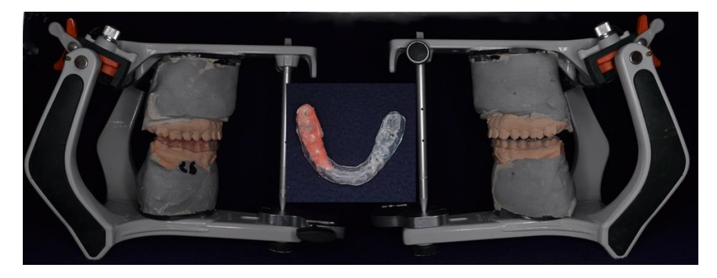
Figure 1. Cast mounted in semi-adjustable articulator and rigid mandibular splint design.

contacts) with the eyes open; the second measurement was recorded 15 min after applying the occlusal device and the third one 30 min after applying the splint. The value of the measurement in each moment (T0, T1, T2) was obtained by calculating the mean of 10 consecutive registrations at 3-s intervals.