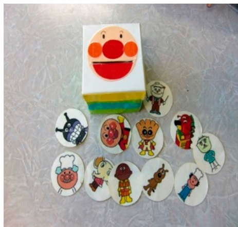
Figure 1. Anpanman savings box (created using a milk carton).

Figure 1: This handmade toy is a saving box shaped like Anpanman for children to enjoy touching original coins with various Anpanman characters drawn on and dropping them into the saving box. The coins with visually enjoyable drawings are also usable as cards.