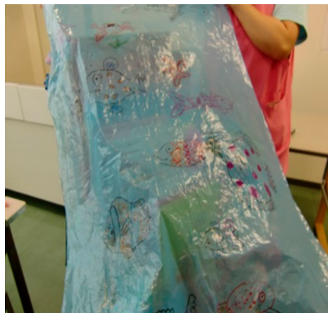
Figure 3. World of the sea (created using a plastic sheet).

Figure 4: This toy consists of a cord, hooks, and various materials with holes, such as rings made from glittering tapes of different colors and bells, threaded onto the cord. For children in bed, the cord is hooked at the bedrail, and rings are slid toward the opposite side at a signal from HPS, such as “Here they go! Choo!”, so that they enjoy the movements and sounds of rings that move while rotating and changes of color.