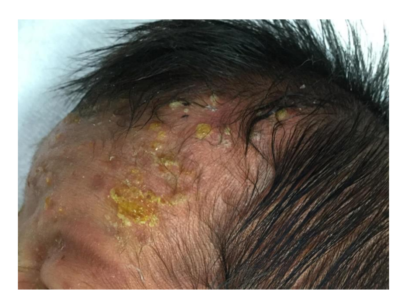
Figure 2. One week after birth, the patient developed ring-shaped plaques consisting of pustules, crusts, and erythema on his scalp and forehead. Pigmentation was seen on the forehead, consistent with previous erythema and pustules.