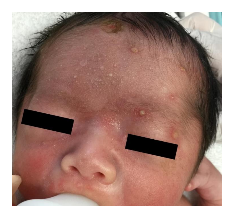
Figure 1. At birth, the patient developed multiple pustules measuring 1–5 mm and a few erosions with erythema on his scalp and forehead. Some pustules were crusted.

range: 3400–9400/µL), normal eosinophil count (500/µL; reference range: 0–658/µL), normal \beta -D-glucan level (9.9 pg/mL; reference range: <20.0 pg/mL), elevated thyroid-stimulating hormone level (10.76 µIU/mL; reference range: 0.34–3.88 µIU/mL), normal free triiodothyronine level (1.05 ng/dL; reference range: 0.95–1.74 ng/dL), and decreased free thyroxine level (1.82 pg/mL; reference range: 2.13–4.07 pg/mL). The Tzanck test results of the pustules showed no multinucleated giant cells. Bacterial and fungal cultures of the pustules were performed, and treatment was started as infectious pustulosis before the results were obtained. The infant was treated with topical nadifloxacin and ketoconazole, and infusion of acyclovir, cefazolin sodium, and vancomycin hydrochloride.