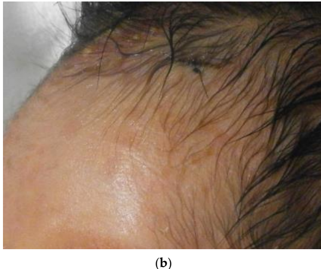
Figure 4. (a) New pustules continued to appear on the right forehead after topical ketoconazole treatment. (b) The pustules and erythema disappeared on the left forehead after topical corticosteroid treatment.