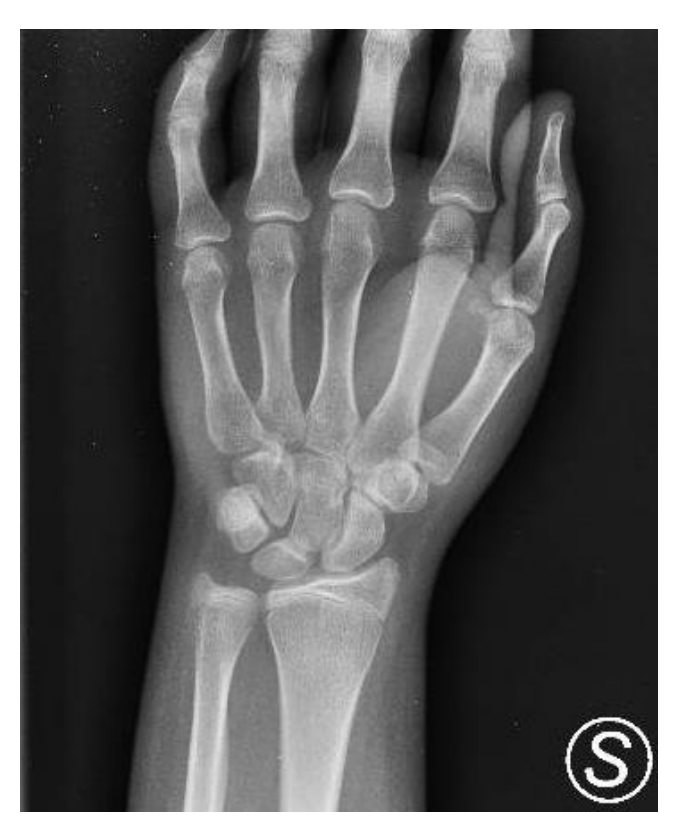
Figure 1. X-ray of the left wrist. Images not attributable to periosteal reaction.