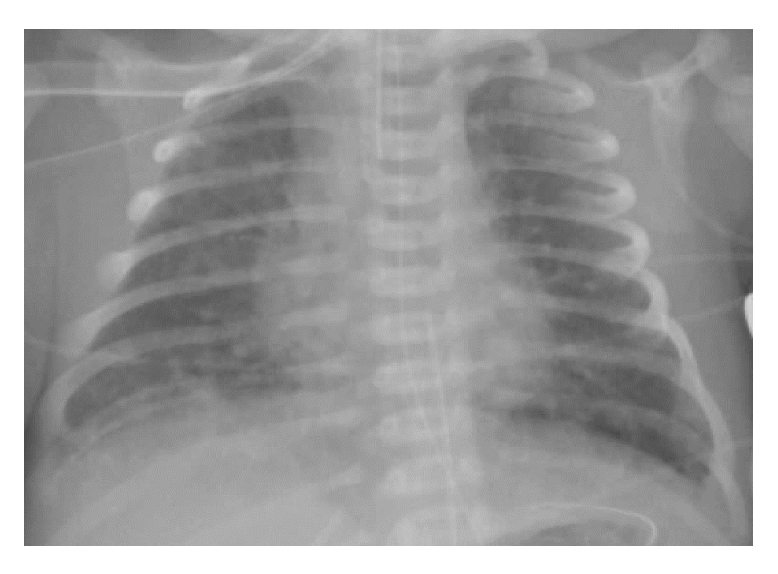
Figure 2. Chest X-ray of meconium aspiration syndrome.

The diagnosis of MAS is based on maternal history (full-term or post-term pregnancy, perinatal distress, the presence of MSAF), clinical features (a full-term or post-term newborn with meconium painted skin and respiratory distress characterized by the hyperexpansion of the thorax) and a chest X-ray (pulmonary hyperinflation with cottony and patchy infiltrates alternating with areas of hypertransparency; Figure 2).