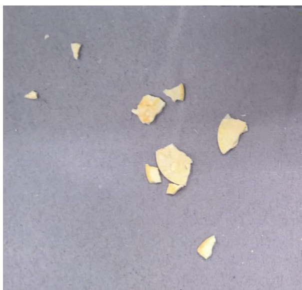
Figure S2. Typical fragmentation after drop tests of a pellet prepared compressing neat MOF-801.