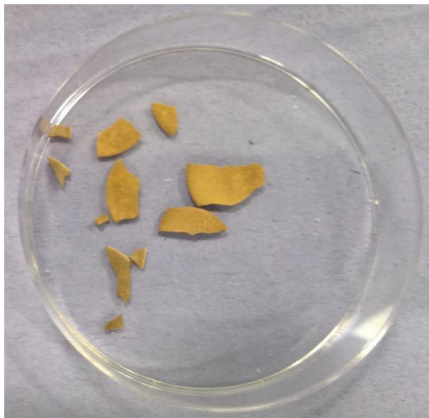
Figure S3. Typical fragmentation after drop tests of a pellet prepared compressing MOF-801 blended with 5 wt % sucrose.