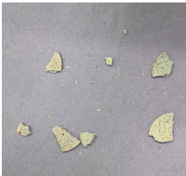
Figure S4. Typical fragmentation after drop tests of a pellet prepared compressing MOF-801 blended with 5 wt % PVA.