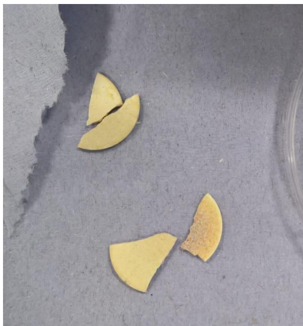
Figure S5. Typical fragmentation after drop tests of a pellet prepared compressing MOF-801 blended with 5 wt % PVB.