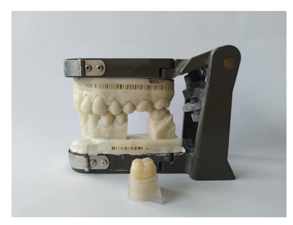
Figure 1. The test model with several interchangeable PMMA sockets and one of three different preparation geometries of the natural teeth (n = 10).

10 extracted non-decayed first lower molars were selected. These teeth were fixed<sup>a</sup> in sockets<sup>b</sup>, which were placed in a 3D-printed model<sup>c</sup> in the first lower molar position (tooth 36) (Figure 1). The extracted teeth were numbered (from 1 to 10) and then prepared using rotating diamond-coated preparation instruments. Ten different preparations were made: four inlays (mod cavity), four partial crowns (always with one or two cusps removed) and two full-crown preparations. The preparation of the teeth was conducted according to all-ceramic preparation guidelines [1,5,10,11,13,29,30].