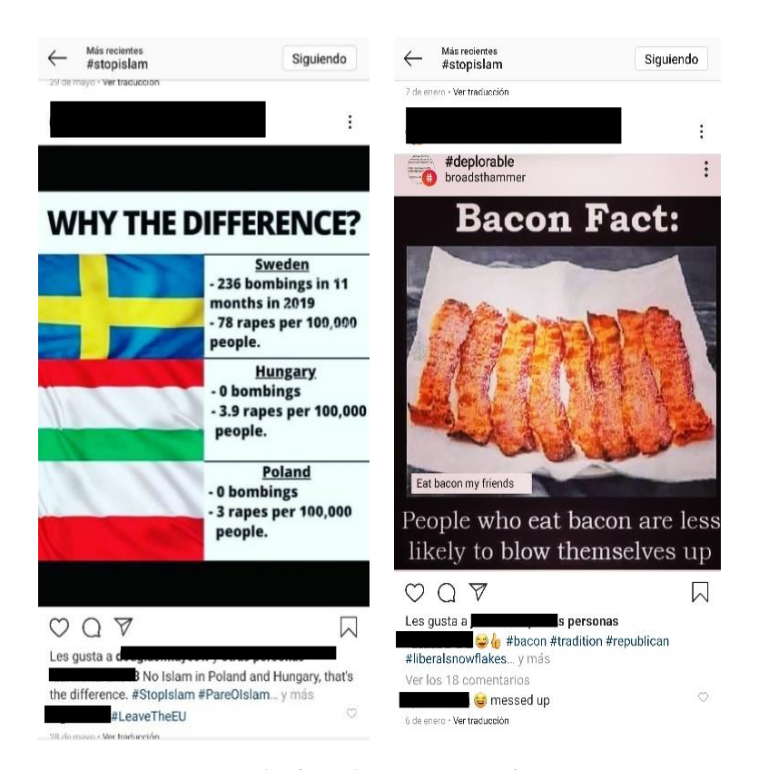
Figure 4. Examples from the category Muslims are terrorist .