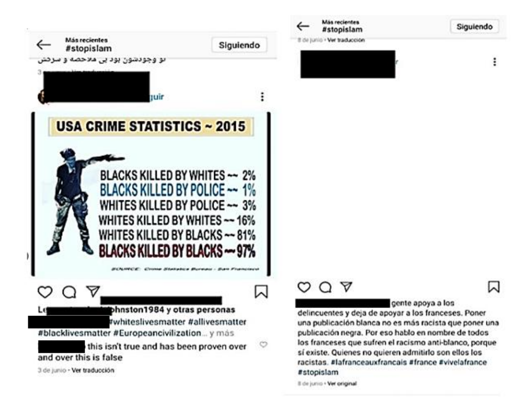
Figure 2. Examples from the category A war between Muslims . Caption: People support criminals and stop supporting the French. Putting a white post is no more racist than putting a black post. That is why I speak on behalf of all French people who suffer from anti-white racism, because it does exist. Those who don't want to admit it are the racists.

On the other hand, the months of June and July see the highest number of publications (105 and 107) and encodings (78 and 82). This is due to the social networking movement of #BlackLivesMatter and its counter-narrative #WhiteLivesMatter, which associates people of color with Islam's practice (see Figure 2). This association reflects the misinformation and ignorance of the population about Islam's meaning, reflecting the unfamiliarity and impossibility of understanding "others".