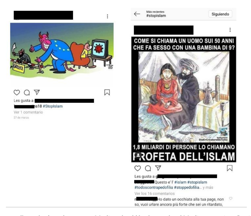
Figure 5. Examples from the category Muslims should be deported and Muslims as rapists. Caption: What is the name of a man who with 50 years has as a partner a girl of 9? 1.8 million people call him the prophet Muhammad.