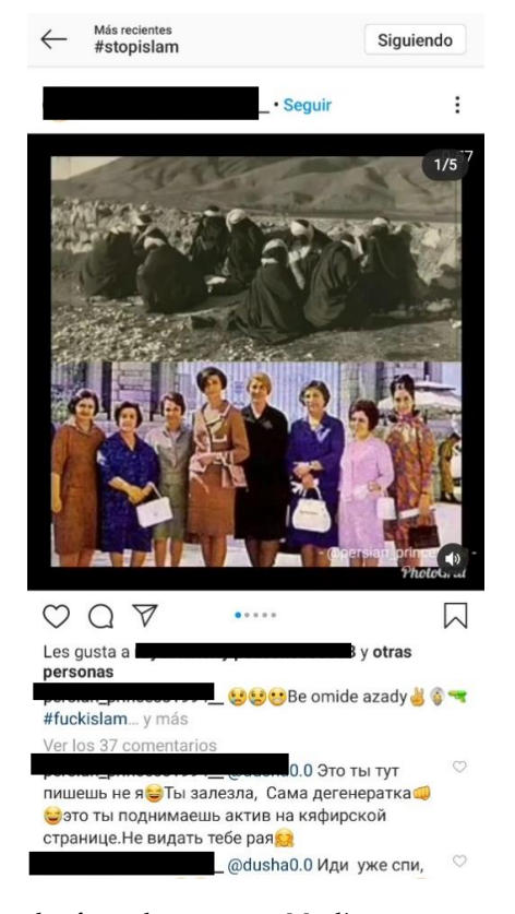
Figure 6. Examples from the category Muslim women are a security threat.