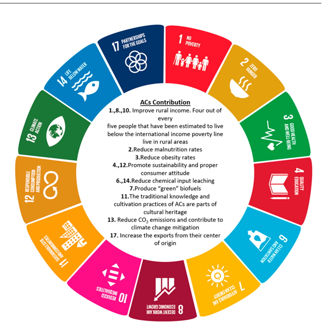
Figure 3. ACs and the SDGs set by the UN. Each SDG is depicted with a different color and is attributed its corresponding number. The contribution of ACs to the SDGs is depicted in the center of the figure next to the corresponding number of each SDG.

Author Contributions: Conceptualization, A.M. and I.K.; methodology, I.K.; software, I.R.; validation, A.M., I.R. and I.K.; formal analysis, I.R.; investigation, A.M.; resources, I.K.; data curation, I.R.; writing—original draft preparation, A.M.; writing—review and editing, A.M., I.R. and I.K.; visualization, A.M. and I.K.; supervision, I.K.; project administration, I.K. All authors have read and agreed to the published version of the manuscript.