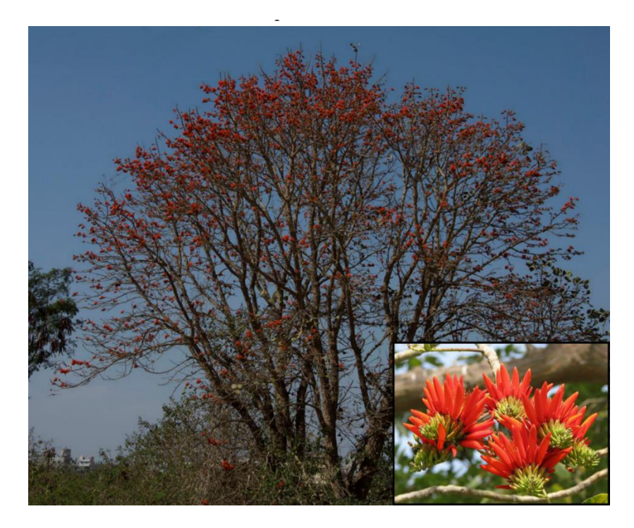
Figure 1. Erythrina suberosa Roxb. tree and flowers.

E. suberosa is widely distributed in plain regions of India (common around Pune), Nepal, Bhutan, Burma, Thailand and Vietnam, sporadically on hills and on moist slopes [11,12]. Although the number of Erythrina species is large worldwide, in India there is a limited number of plants belonging to Erythrina genus, such as E. suberosa , E. fusca Lour., E. resupinata Roxb., E. stricta Roxb., E. arborescens Roxb., E. subumbrans (Hassk.) Merr., and E. variegata L. (syn. E. indica Lam.), which are all wild species. There are also cultivated species: E. crista-galli L., E. corallodendrum L., E. mitis Jacq., E. poeppigiana (Walp.) O.F. Cook., and E. blakei Parker [13]. It is notable that all of these reported species are also present in Andhra Pradesh, Pakistan and Nepal.