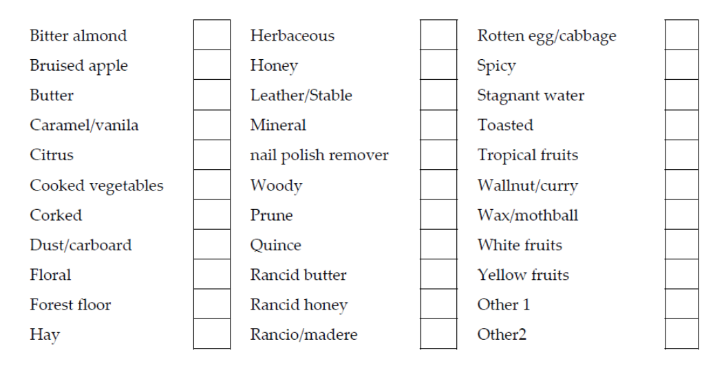
Figure 1. Ballot used for the general odor description (translated from French).