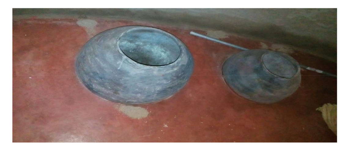
Figure 5. Floor mounted fermentation vessels in Zimbabwe.

Traditional fermentation processes are customarily uncontrolled and depend on the microorganisms from the environment or the normal microflora of the substrate to initiate fermentation. Such fermentation processes often result in variable yield and quality of the beverage [62]. The most common traditional beverages are products of spontaneous or batch accelerated fermentation. Fermentation in the former is mostly due to the presence of resident yeast flora of the fruit surfaces, or from brewing equipment, whereas the latter involves pitching of the mixture to be fermented with a previously fermented brew. The production of traditional non-cereal-based alcoholic beverages usually involves use of traditional fermentation vessel which are typically clay pots (Figure 5) covered with a cloth, producing wines and spirits, if distilled. The cloths create a slightly anaerobic environment but in some instances, the fermentation vessel is completely closed to create stricter anaerobic conditions. Repurposed polyethylene drums are also increasingly used as fermentation vessels in traditional settings.