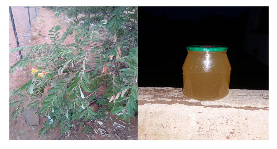
Figure 3. Grewia flava tree (mogwana) and khadi.