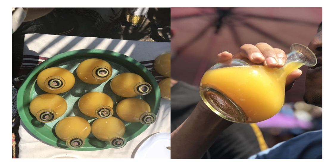
Figure 4. Tej—a cloudy unrefined honey wine.