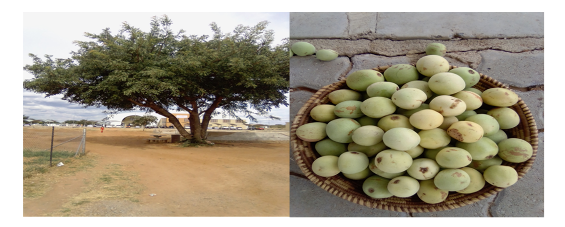
Figure 2. The marula tree (Sclerocarya birrea sub-species caffra) and the marula fruits.