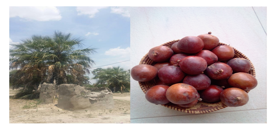
Figure 1. The Hyphaene petersiana (mokolwane/moxao) tree and the ripe fruits during the summer season.