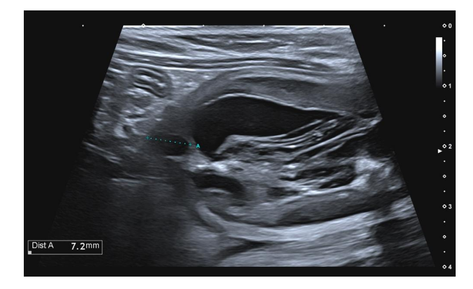
Figure 2. Longitudinal ultrasound image of the urinary bladder in a cat, showing the presence of a small, fluid-filled, anechoic structure, in the cranial bladder wall, showed by the cursor indicated with the letter "A", consistent with intramural vesicourachal diverticulum.

Table 2. Abnormal ultrasound findings for the urinary bladder and pericystic peritoneal space in all patients.