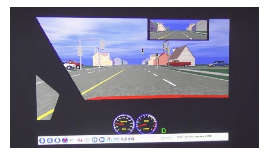
Figure 1. Example (still) of driving simulator video clip presented to participants.

Participants were given a detailed set of instructions at the beginning of the survey. They were asked to watch a series of thirty clips of simulated driving through intersections, and answered two questions after each clip. The first question asked them to classify individuals in terms of cognitive status (i.e., cognitively healthy vs. cognitively impaired). The second question asked participants to provide a safety rating on a 10-point Likert scale ranging from "Very unsafe—0" to "Very Safe—10". A still example of a clip can be seen in Figure 1.