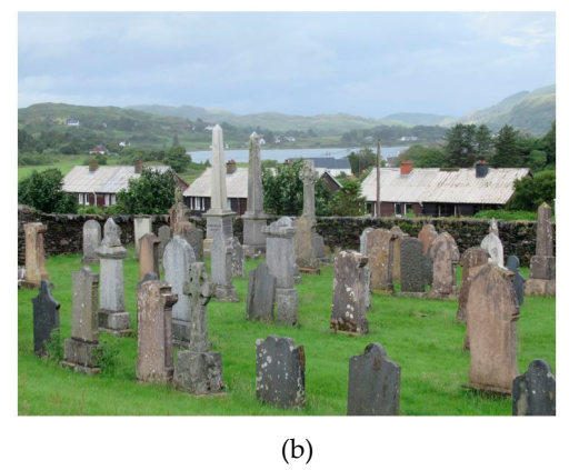
Figure 2. (a,b) The ancient burial ground on Little Bernera, a small Outer Hebridean island, shows characteristic irregularity and a preponderance of small, anonymous stone markers. This arrangement is in contrast to the more regular rows of the more modern graveyard at Balvicar in Argyll. The latter graveyard also features many headstones made from local slate which retain legible inscriptions.

4 I do not claim that these results are unique to men in North West Scotland. A comparison with urban and Lowland areas is required.