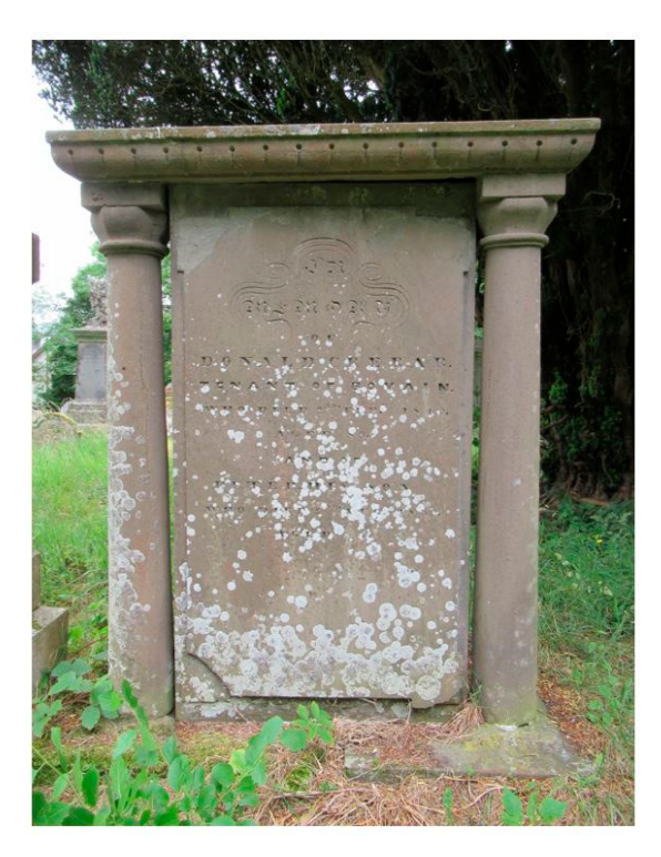
Figure 5. This expensive-looking headstone is for Donald Crerar, the tenant of Bovain, near Killin in Perthshire.