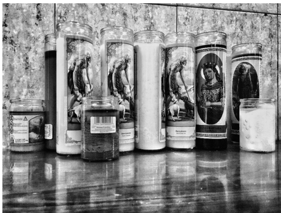
Figure 6. Despite the free candles given out by the church, devotees often bring their own glass votive prayer candles to Rincón . After a few visits from the concerned local fire marshal, the church decided to only permit their metal-encased tea lights on San Lázaro’s altar. This policy, enacted no doubt to appease the fire department and help reduce the chances of a potentially catastrophic fire in the sanctuary, has not deterred visitors from bringing the forbidden prayer candles. Raphael, the man in charge of overseeing the altar while the church is open, is always busy arranging flowers brought to San Lázaro by parishioners and monitoring contraband candle lighting.