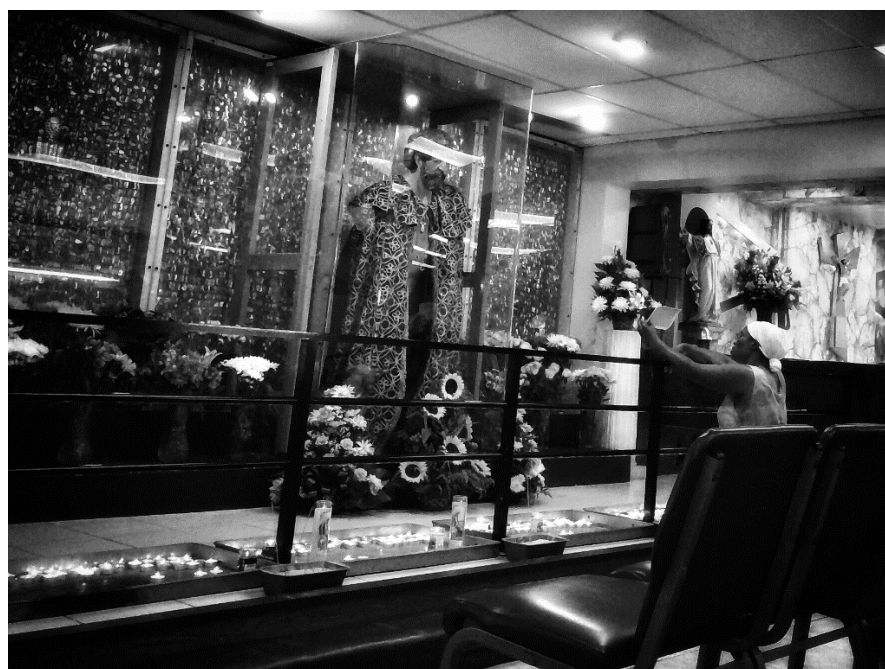
Figure 12. Kneeling in front of San Lázaro, a woman holds up an envelope of some sort and petitions the saint for his help. Due to the saint's association with the poor man Lazarus in the Gospel of Luke, it is not uncommon for devotees to seek out San Lázaro's help with financial and legal matters as part of his holistic healing capabilities. A few of the men I spoke with at the Rincón also mentioned asking San Lázaro for help when they desired to leave Cuba to come to the United States.