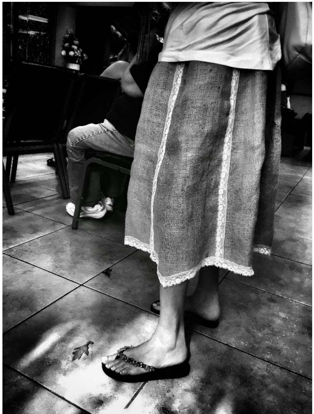
Figure 10. During my time at Rincón de San Lázaro , I witnessed several individuals coming to the church dressed in burlap clothing. Most of the clothing appeared custom-made and ranged from simple skirts to more elaborate outfits, including embroidered burlap vests, pants, and jackets. The symbolic importance of interweaving purple cloth and burlap was evident among devotees wearing these custom-made outfits. I also witnessed a woman wearing a burlap skirt who crawled on her knees from the front door of the church to San Lázaro's altar. For San Lázaro's devotees, wearing burlap is a way in which they experience the saint through their skin. This public act of devotion is more than a performance of faith; it is the enfleshing of belief in San Lázaro's healing powers.