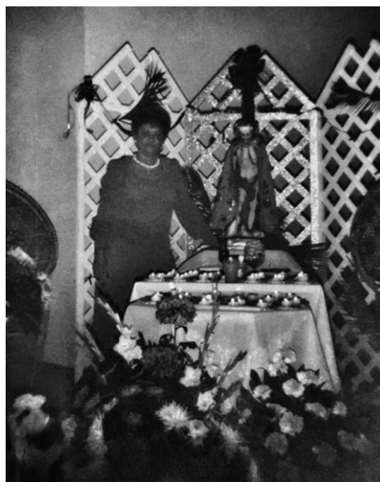
Figure 3. While looking through old family photographs, I often spot San Lázaro's image somewhere in the frame. Whether as a charm hanging on my abuela's necklace, standing outside her front door, or towering over a group of Cuban devotees dancing in a banquet hall on 17 December, San Lázaro was always there. I recall attending the saint's elaborate yearly feast day celebrations as a child. These celebrations were sponsored by a Cuban fraternal organization in Miami, Florida, called Municipality of Cabaiguán in Exile. At these celebrations, there was always a large statue of San Lázaro (pictured here with my abuela) adorned with a purple and gold cape, surrounded by candles and purple and yellow flowers, and sometimes other offerings like money, tobaccos, dry wine, and even certain food items. Photo courtesy of the author c. 1986.

My abuela's interweaving of fine purple fabrics and burlap cloth is indicative of her understanding of this aspect of San Lázaro's meaning. San Lázaro's cape, merging a range of disparate elements, evokes Isasi-Díaz's description of lo cotidiano as "where we first meet and relate to the material world that is made up not only of physical realities but also is made up of how we relate to that reality (culture), and how we, understand and evaluate that reality and our relationship with it (history). Lo cotidiano is necessarily entangled in material life and is a key element of the structuring of social relations and its limits. Lo cotidiano situates us in our experiences. It has to do with the practices and beliefs that we have inherited, with our habitual judgments, including the tactics we use to deal with the everyday" (Isasi-Díaz 2002, p. 8).