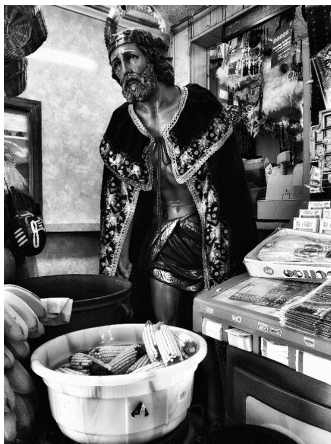
Figure 2. Located across the street from Rincón is a botanica, named Botanica San Lázaro, that caters to the religious supply needs of practitioners of Santería/Lucumí who also frequent the church. Patrons are greeted by a somber towering statue of San Lázaro, who stands in front of the register, next to a stand of empty lottery tickets which visitors to the store can purchase along with candles, amulets, and a plethora of other religious goods.