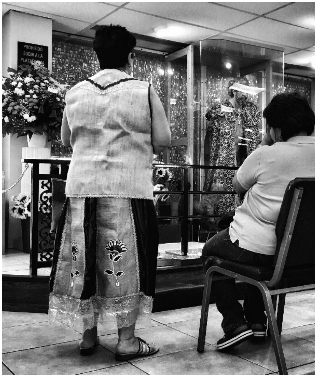
Figure 9. The use of burlap among San Lázaro devotees is perhaps one of the most fascinating aspects of the saint's symbolic language that contributes to the genealogical healing narratives passed on by his believers. His devotees wear burlap clothing as a sign of devotion or as fulfillment for a promise made to him. Wearing burlap links San Lázaro's devotees to his poverty and suffering and mirrors the painful experience of his diseased body. Other promises made to San Lázaro include bringing him flowers, candles, cigars, money, or milagritos (charms in the shape of body parts that devotees will give to the saint to thank him for healing them or a loved one).