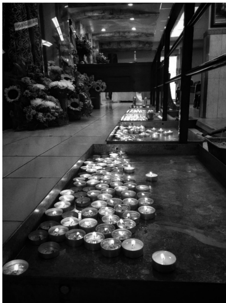
Figure 5. As part of the services provided to the community of devotees, Rincón de San Lázaro church gives out small tea lights to anyone who wants to light a candle for San Lázaro. On any seventeenth of the month (except on San Lázaro's feast day on 17 December), Rincón's bishop estimates that approximately one thousand parishioners visit the church, meaning that more than one thousand candles will be given out freely and lit for San Lázaro as a part of devotees' prayer rituals. Because the number of candles is so great, the church requires that visitors place the tea lights on galvanized steel trays to catch dripping wax and help prevent fires.

theme brought up by my interlocutors. I encountered lo cotidiano in the everyday expressions of faith and devotion to San Lázaro. Most of my photographs might be described as mundane; they do not show what some might deem spectacular performances of faith, such as prostrations or manifestations. However, a more nuanced look reveals defining aspects of lo cotidiano present throughout the church and its visitors. See Figures 5–12.