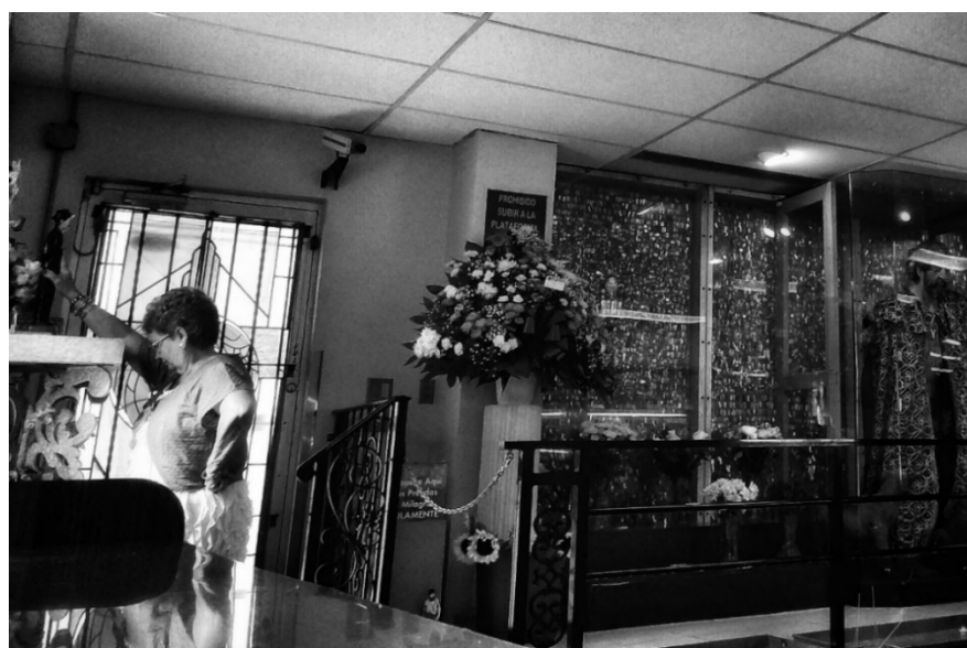
Figure 11. San Lázaro shares his church with other powerful saints popular among the Latinx community of South Florida. Due to the number of visitors who wish to come into physical contact with San Lázaro's effigy, his towering statue is kept behind a doubly protective enclosure, as is the large statue of Santa Barbara, located near the front of the church. Small statues of many of the saints popularly worshipped by Cubans and Cuban-Americans are similarly protected in the church. After lighting a candle and praying to San Lázaro, a woman moved to an area just to the left of the saint's effigy, where a small altar to the venerable Dr. José Gregorio Hernández is located. Placing her right hand on the small statue, the woman bowed her head and prayed. She remained in this position for a few minutes before marking herself with the sign of the cross and walking away. Dr. José Gregorio Hernández's statue is among the few in the church available to visitors for direct contact since it is not behind a protective barrier.