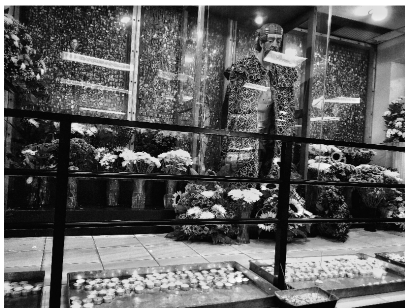
Figure 1. The statue of San Lázaro at Rincón de San Lázaro church stands on an elevated altar, behind metal barriers, and encased in protective plexiglass. Behind the statue are innumerable mil-agritos , gold, and silver charms shaped as different body parts, that the devout bring to the saint as offerings and thanks for the healing of their various ailments. Photograph by author 2016.