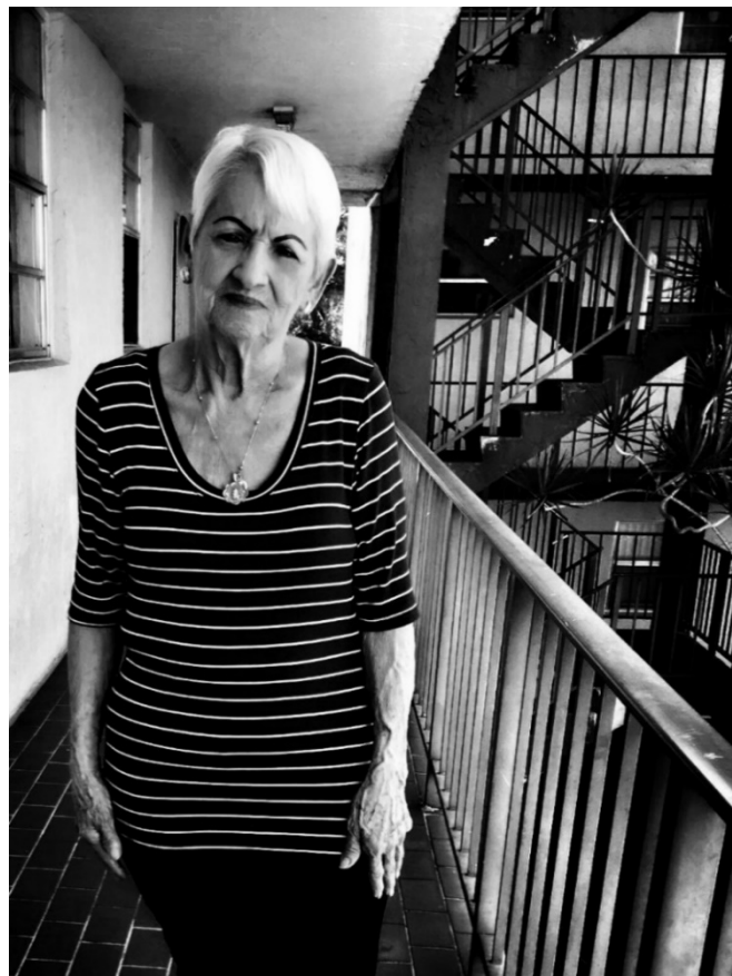
Figure 4. At 85, my abuela continues to wear her San Lázaro medallion on her necklace. A few years ago, while she was ill, she told me she wanted me to pick whatever I wanted to keep of hers when she passed away. I told her the only things I wanted were her saint statues and her necklace, where she wears an assortment of saint charms and other religious items. Not wanting to wait, my grandmother took off her necklace and told me to take it then and there. I told her I did not want her to be without it, but she insisted. A few weeks later, my abuela was still feeling unwell. She told me she had a dream about her San Lázaro medallion and that the reason she was still feeling sick was because she was not wearing it. She asked me if it would be okay to give her back just that one charm from her necklace and that I could have it back when she passed away. I, of course, obliged and promptly went to her apartment to return San Lázaro's medallion.

and the next she was up and about. Although I am sure that significant time elapsed in between, I cannot recall any other memories of her recovery process. In conversations with my aging abuela about this time in her life, she seems only to remember how painful her recovery was and how she would have never overcome it without San Lázaro.