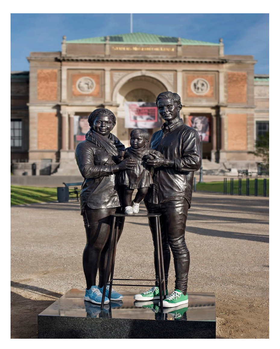
Figure 3. 'A Real Danish Family', 2017. Source: https://www.tanyabonakdargallery.com/artists/64-gillian-wearing/works/10301-gillian-wearing-a-real-danish-family-2017/. Photograph credited to Heine Pedersen. Accessed on 1 May 2021.