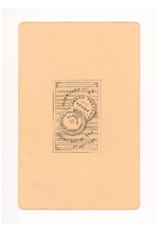
Figure 12. Unnamed Freemason. 1870s. De Beer album, 1936/118/3, recto and verso.