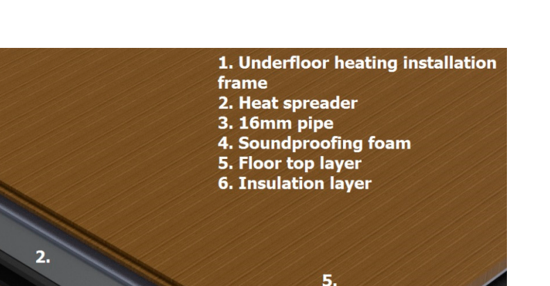
Figure 3. Final concept.