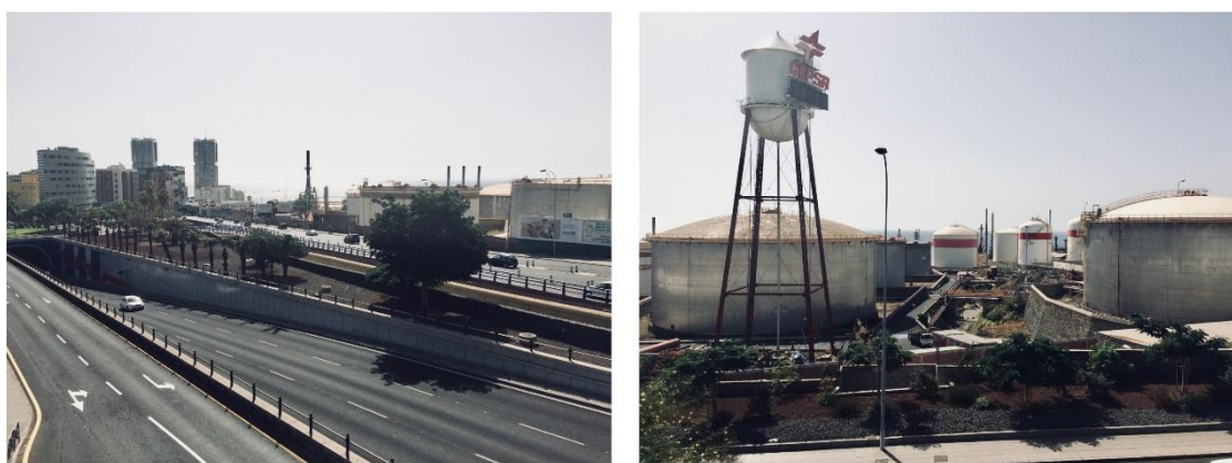
Figure 2. The oil refinery “Tenerife” in Santa Cruz de Tenerife.

This paper deals with the megaproject “Santa Cruz Verde 2030”, which aims to transform an inner-city oil refinery (Figure 2) into a new urban neighborhood. Santa Cruz is the capital of Tenerife and co-capital of the Canary Islands, one of the 17 Spanish autonomous communities. With its 200,000 inhabitants, the city forms part of the metropolitan area of the island, where about 400,000 inhabitants live [40].