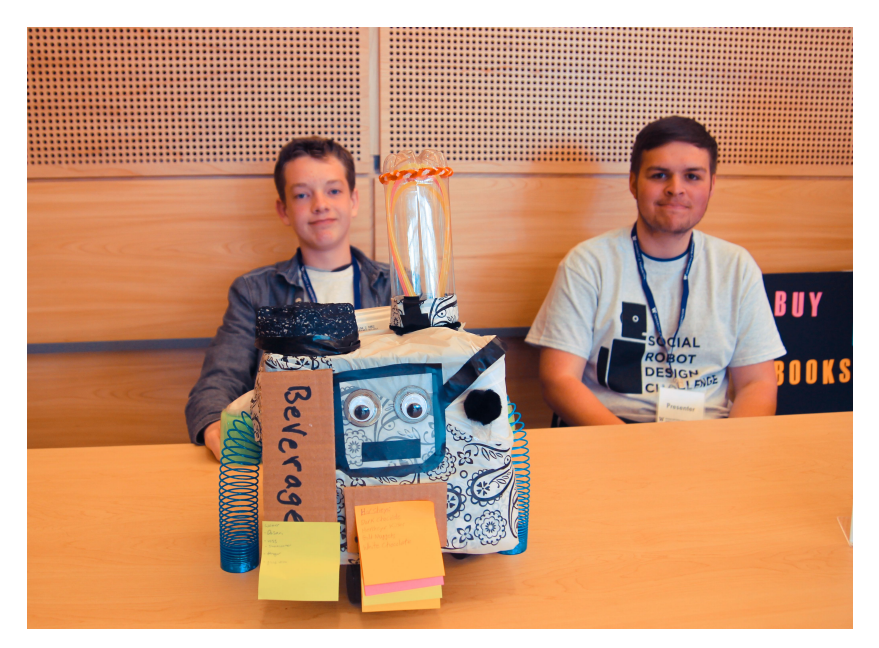
Figure 4. Two teens share their robot prototypes at the showcase.

As a culminating event for the social robot design challenge, we invited the schools who had created robots to attend a Social Robot Design Challenge Showcase, which was hosted on our university's campus and was open to the public. Six of the seven participating schools attended and each team presented their robot designs to a team of experts in social robotics, including researchers from academia and industry. Each team presented their design that included a description of the features of their robots and a rationale for why they designed the robot the way they did (Figure 4). They also prepared and screened a presentation video that documented their design and rationale. Each team answered questions from the expert judges, other teens, and the general public.