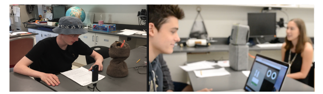
Figure 5. Teens interacting with: the soft-bodied robot Blossom (left); and Project EMAR Version 4 (right).

For example, in order to better understand the importance of movement and voice in teen–robot interactions, we conducted a study of two distinct robot prototypes. One was Blossom, a soft bodied, flexible robot with a crocheted outer shell [96] (Figure 5, left). Blossom was teleoperated using a smartphone as a gyroscope by a teen. The second prototype was Teen-Health-Bot [pseudonym] Version 4, a soft, but boxy robot with a rendered face on a tablet and a belly tablet displaying text (Figure 5, right). V4 also uses a robotic voice to communicate. Teens operated each devices in response to a prompt to express empathy toward a teen sharing a stressful experience. Using the stress story scripts written previously by teens, one teen read the script, while the operator (using only movement, or typing a verbal response) responded. In addition to the script reader and the teleoperator, two other teens acted as witnesses to the interaction. All teens then responded to a brief survey about how they rated the robot's response to the teen and how they felt operating the robotic device.