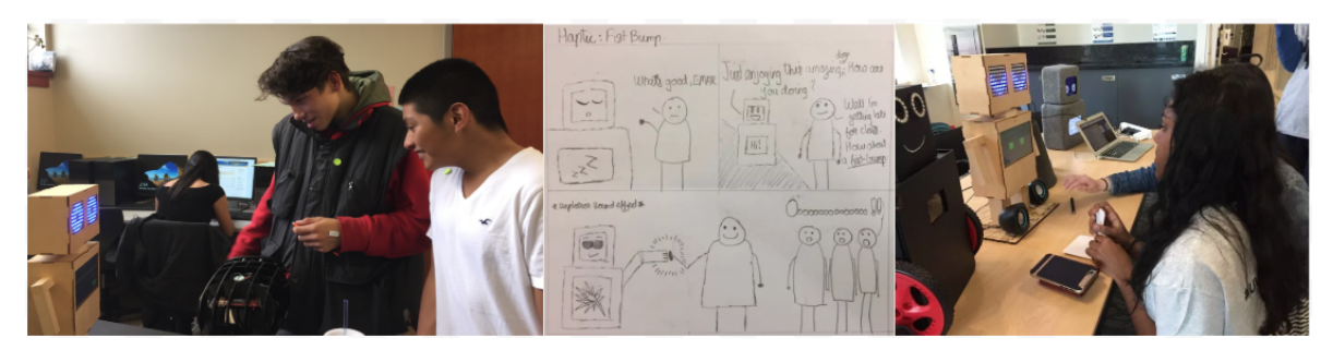
Figure 1. Adolescents engaging with various EMAR prototypes in the wild.

In our design process, we invited teen participants to take part in all of our research activities where they provided ideas on how the robot should look, behave, interact, and move (see Figure 1). Teens even participated by designing their own prototypes and features. They also participated by taking the role of researcher, gathering data from their peers, writing study scripts, manipulating robots during sessions, and discussing their ideas and opinions. In doing so, we leveraged their unique creative abilities and centered their engagement in the process of everything we do. Successful design of a social robot specifically for teens requires not only an intentional and contextually appropriate design, but also appropriate and transparent methods by which to engage teens in the process.