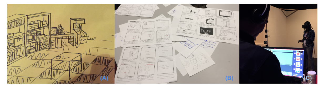
Figure 6. Stages of the virtual reality project: (A) sketching; (B) storyboarding; and (C) asymmetric gameplay.

In user research, often the think-aloud protocol [97] is a technique to understand a the experience of a user as they go about a task. We wanted to understand choice and decision-making as teens selected and assembled robots, knowing that talking aloud is not comfortable for teens (from previous field work). Therefore, we created a collaborative game that required talking between teens in order to succeed. To do this, we developed an asymmetric VR game design [98], meaning one player is outside of VR, operating a computer with a headset and microphone, allowing them to connect to the other player who is inside immersive VR. Together, the teens collaborated (each had different abilities) to agree upon and assemble a robot together. Once assembled, the teens were invited to engage in an interaction with the newly developed robot. The outside player could teleoperate the robot while interacting with the in-VR teen, providing rich interaction data. Like all of our interaction studies, We conducted these VR robot interaction sessions at school by setting up VR equipment in libraries and classrooms. Teens engaged easily and eagerly with the VR platform and reported that they found both the internal and external roles fun. Most importantly, we were able to capture valuable data, through gameplay recordings about how teens collaborate as well as insights into the teens' perceptions of robot roles and behaviors. See Figure 6 for examples of the teen's sketches and gameplay.