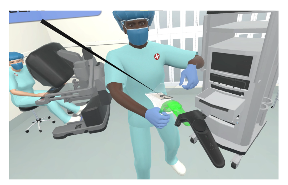
Figure 1. A first-person perspective of the VR training application used for our research.

Table 2. The subtasks and their required interactions involved in the VR training simulation.