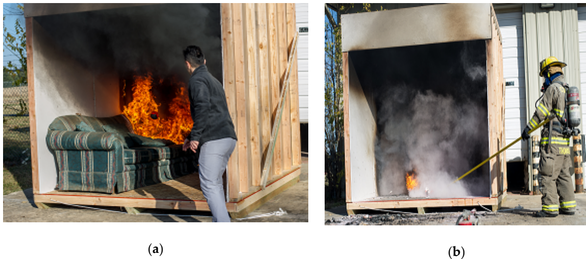
Figure 3. (a) 'Class A' fire in the demonstration cell for the case study; (b) 'Class B' fire in the demonstration cell for the controlled experiments.