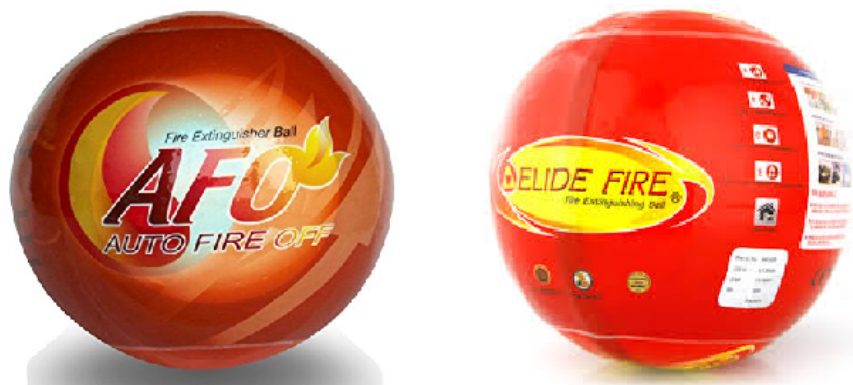
Figure 2. AFO and Elide fire extinguishing balls [8,9].

experiment with the use of these balls for building fires and wildfires. Figure 2 shows the Elide and AFO fire extinguishing balls.