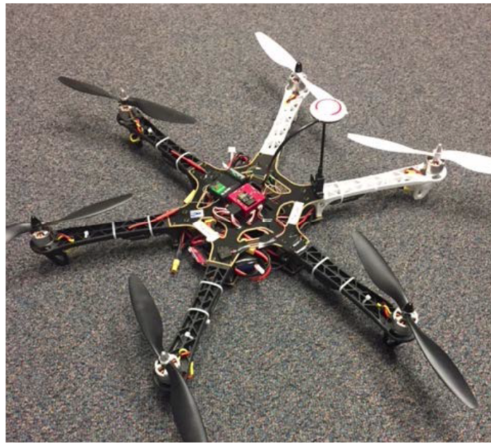
Figure 5. Scouting unmanned aircraft system (UAS).