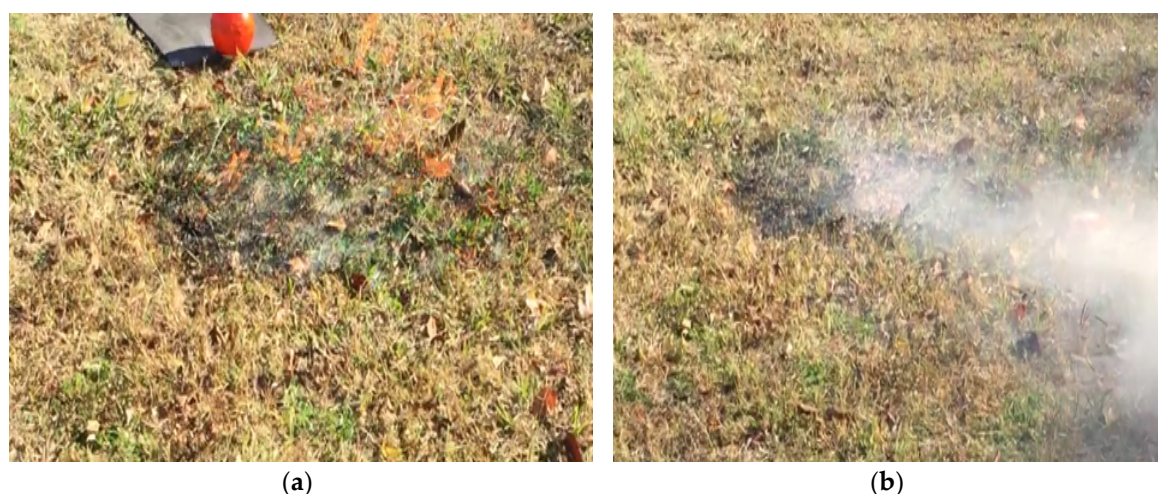
Figure 4. (a) Short grass fire before explosion; (b) short grass fire after explosion.

Contrary to the building fire experiments, the research team got promising results for the wildfire case. It took around same time for the AFO model to explode, and the short grass fire was completely extinguished in both trials. Figure 4 shows the short grass fire before and after explosions.