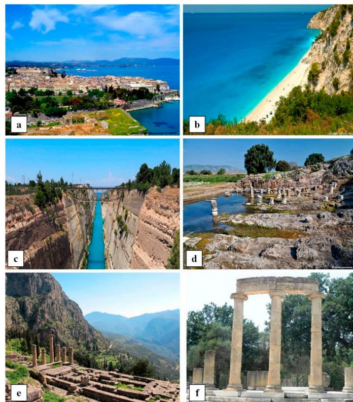
Figure 5. The main attractions of Greek pilot sites: (a) Corfu island; (b) steep white cliffs of Lefkada; (c) Corinth Isthmus between the Saronic Gulf and the Corinthian Gulf; (d) ancient Oiniades harbor ruins; (e) Apollo's Temple at the Delphi archaeological site; (f) Philippeion temple in ancient Olympia.

Corfu is the second-largest island in the Ionian Islands (Figure 5a) and is rich with several attractions (Table 2). According to Strabo, Corcyra was the Homeric island of Scheria and its earliest inhabitants were the Phaeacians, although conclusive and irrefutable evidence for this theory or for Ithaca's location have not been found [21]. Corfu was peopled by settlers from Corinth, probably since 730 BC, but it appears to have previously received a stream of emigrants from Eretria [22,23]. The ancient city of Corfu (Paleopoli) evolved in the archaic years between two natural harbors in Chalkiopoulos lake. The largest western hall along with other artifacts from ancient temples of Palaioiopolis is the pediment of the Temple of Artemis from 580 B.C. with gigantic dimensions—17 m wide and 3 m high. Its central theme is the mythical monster, Gorgon [24].