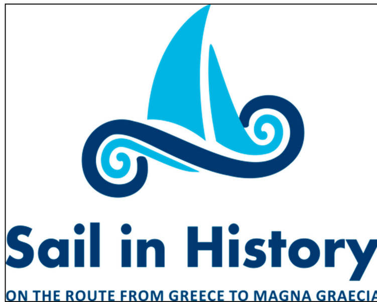
Figure 1. The “Sail in History” logo: A touristic product of the MAGNA project.

The promotion of MAGNA and its product, “Sail in History”, plays a key role in development of the project; thus, dissemination and communication activities are strongly recommended. Participation in international conferences, touristic exhibitions, and meetings with schools and family associations represent some of the events where the MAGNA project was and will be presented.