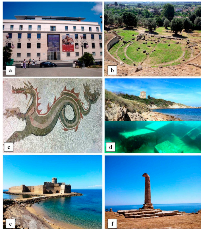
Figure 4. The main attractions of Italian pilot sites: (a) the National Museum of Magna Graecia in Reggio Calabria city; (b) theater in Locri Epizephyrii; (c) precious mosaic from the House of the Dragon in Kaulon; (d) Punta Scifo landscape and marble blocks in the underwater shipwreck; (e) Aragonese Castle of Le Castella; (f) the only column remaining of the Hera Lacinia temple at Capo Colonna.

The archaeological park of Locri Epizephyrii is located a few kilometers from the current municipality of Locri. The polis was founded between VIII and VII century B.C. [14,15] and ruled by a typical Greek model, which is still visible today. The vast park (about 3 km 2 ) contains elements belonging not only to the Greek period, but also to the Romans (Table 1). One of the most famous attractions is the Greek theater (Figure 4b).