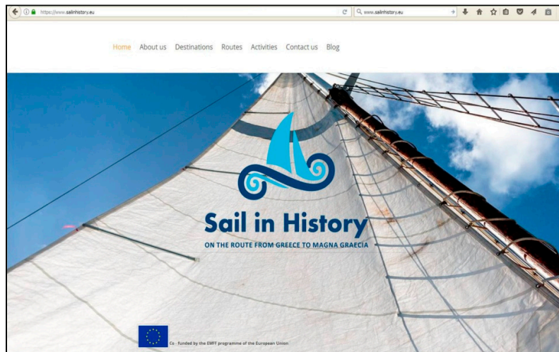
Figure 2. The web site homepage of Sail in History [8].