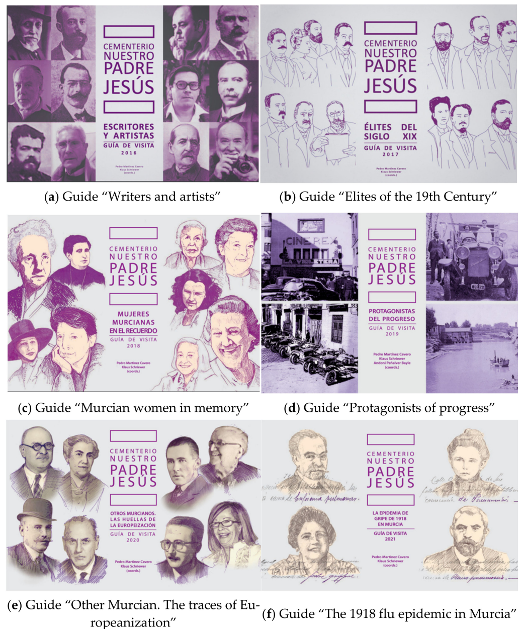
Figure 3. Cover of the six thematic guides to visit the Cemetery.