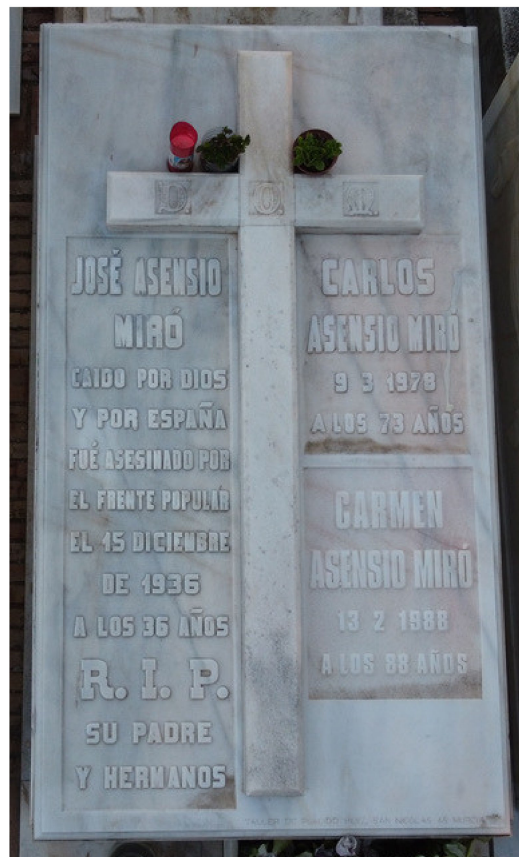
Figure 5. Tomb with inscriptions referring to his participation in the Civil War.

should be conducted according to this criterion, beyond the maintenance given by the families privately.