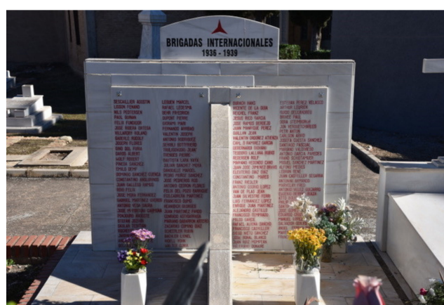
(b) Monument dedicated to “International Brigades”