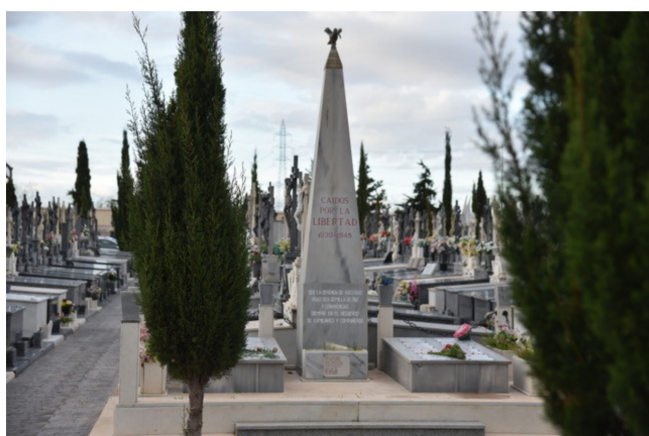
(a) Monument “Fallen from Freedom”

It is interesting to note the multiplicity of versions and “voices” that, on many occasions, make it difficult to reach a consensus on the conservation of the heritage elements of the cemetery. In this case, a clear example of the often-conflicting interpretations of history is the Cemetery “Nuestro Padre Jesús”, in which are the graves of victims of the Civil War. In Figure 4, we find a monument to the “Fallen for Freedom”, honoring some 200 people executed in the first years after the Civil War (Figure 4a), between 1939 and 1943, and a monument to more than 120 soldiers of the International Brigades (Figure 4b).