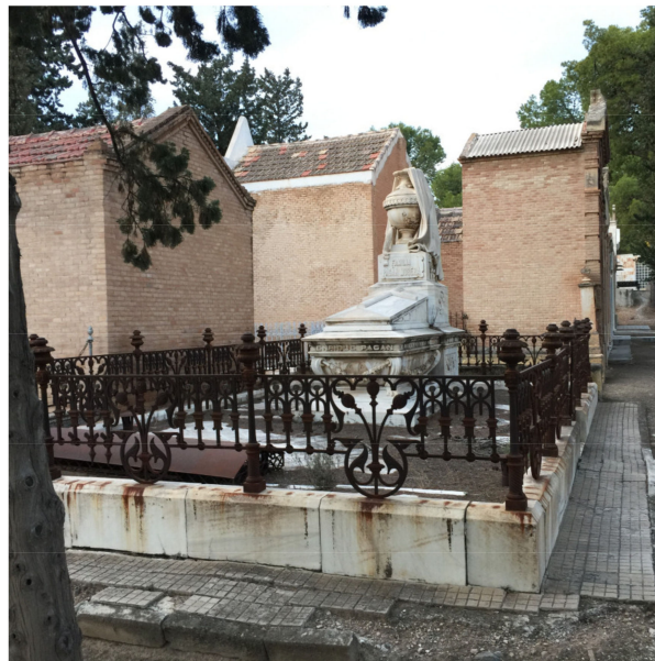
Figure 6. Sarcophagus of the Pagan Ayuso family in the cemetery.

The individual dimension represents the outstanding characteristics of the singular grave that derive from its architecture, artistic value, socio-cultural importance, historical informative value, conservation, and even related documentation. In cemeteries, there are a number of graves that stand out in this regard. There are some graves that are unique in their architecture, have a great informative value with respect to the history of the city, are graves of prominent people, or even combine several of these criteria. Thus, we can highlight, for example, the cast iron pantheon of the industrialist Francisco Peña Vaquero or the sarcophagus of the Pagán Ayuso family (Figure 6), whose conservation in its current state should have a high priority.