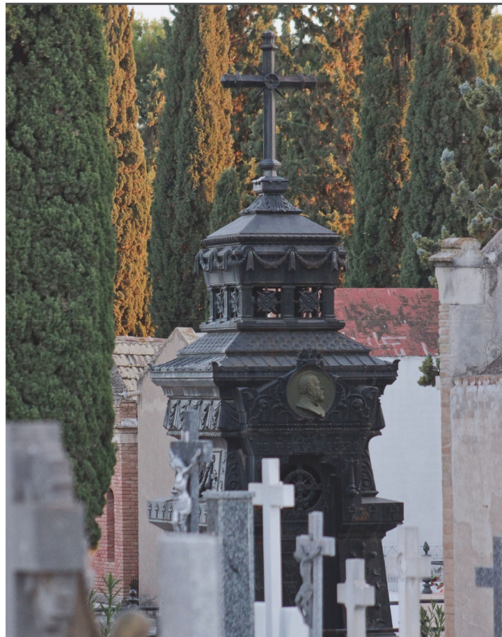
Figure 2. Example of a pantheon. Mausoleum of the entrepreneur Francisco Peña Vaquero (1836–1907).