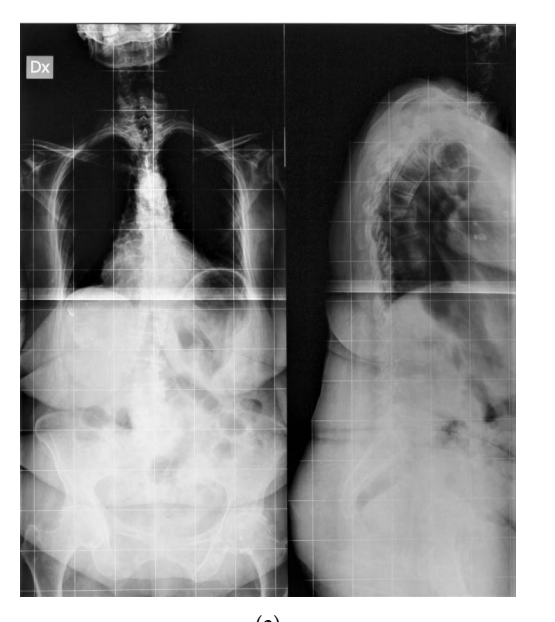
Figure 3 shows the case of a 68 years old female, who was referred to our unit due to persistent low back pain for vertebral steno-instability and consequent sagittal imbalance to undergo spinal lumbo-sacral fusion; clinical and radiological examinations revealed a concomitant severe osteoarthritis in both her hips that was treated with bilateral THA with the G7 modular cementless DM cup. After surgical treatment in the hips, low back pain improved dramatically, and the patient did not need any surgery in her spine.

patients, to allow better accuracy in restoring the anatomy and biomechanics of hip joint. In fact, in the above-mentioned scenarios, the degree of lumbar spine lordosis cannot change to allow the pelvis to tilt so that the range of movement demanded from the replaced hip is greater than that required in a normal THA and higher stability implants, such as DM components, must be considered in this high-risk cohort [20–26].