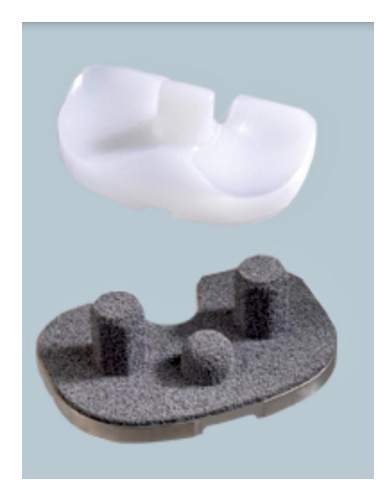
Figure 1. Three-peg modular TMT tibial component.