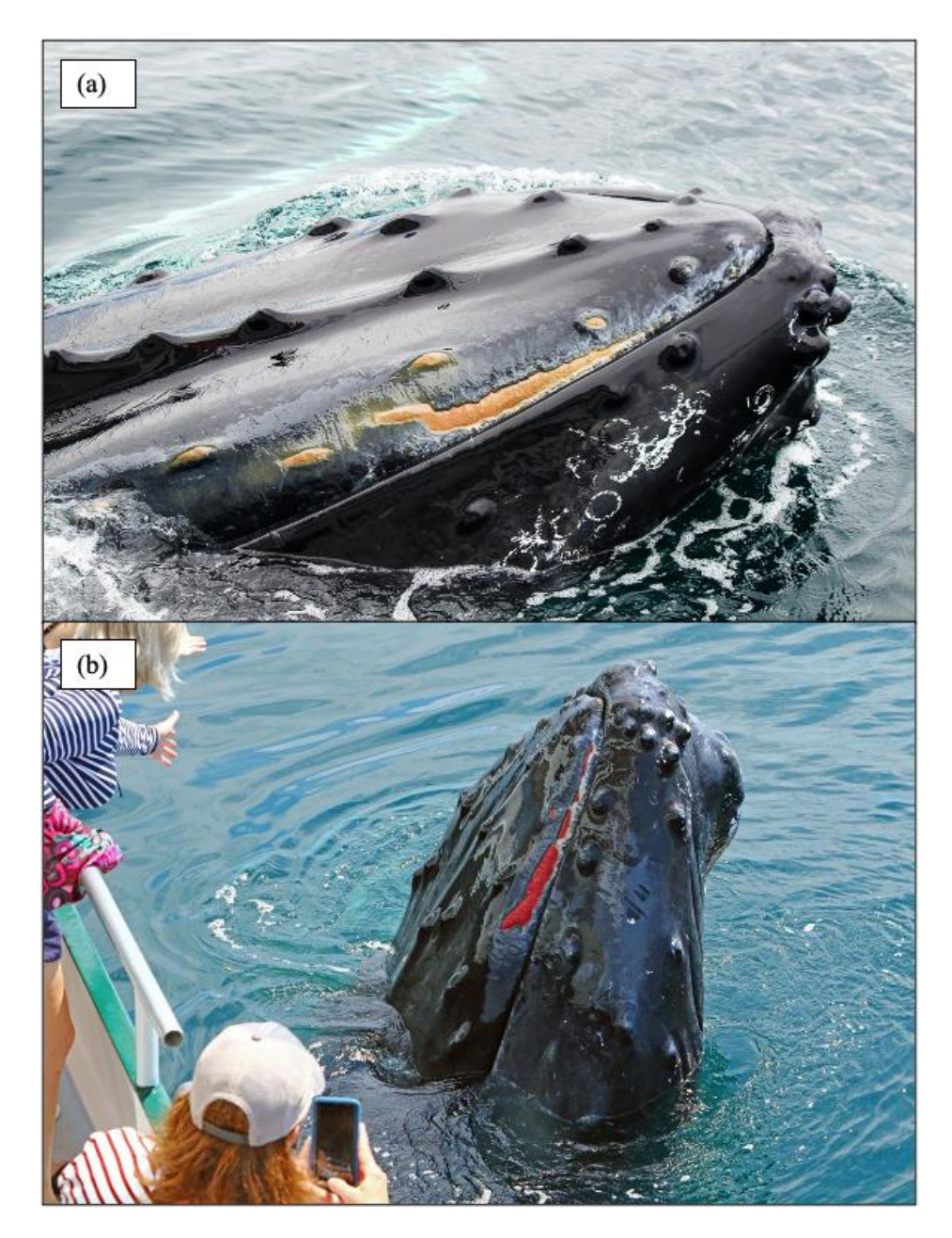
Figure 3. Photographs of observed skin lesions on the humpback whale, likely from bottom feeding for sand lance. (a) Wounds visible, including yellow, necrotic wound edges; (b) evidence from a different individual (not studied here) exhibiting recent abrasion to the same general region of the rostrum area.

At 1502 the whale detached itself from the jellyfish and then approached the observation vessel. At this time, clear evidence of skin lesions from bottom-feeding behaviors were observed on the whale's dorsal rostrum, suggesting a generalized deterioration of skin condition and yellow, necrotic wound edges (Figure 3). Recent abrasion to the skin of the affected area was also apparent, likely due to being covered by the stinging mass of the jellyfish. The whale made a quick visual investigation of the boat and remained near the boat for ~30 min before the vessel left. The individual whale was seen two days later at the same site, engaging in numerous well-described behaviors including lobtailing, tail and fin slapping, and breaching.