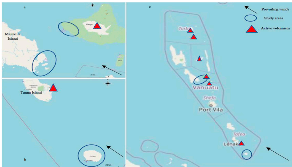
Figure 1. (a) Study areas of Ambrym, Malekula and Maskelyne Islands, south of Malekula. (b) Study area of Aneityum Island. (c) Map of Vanuatu showing study areas and active volcanism.