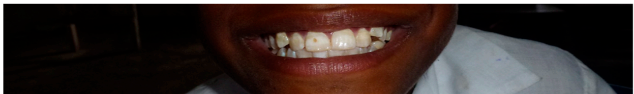
Figure 2. Dental fluorosis.