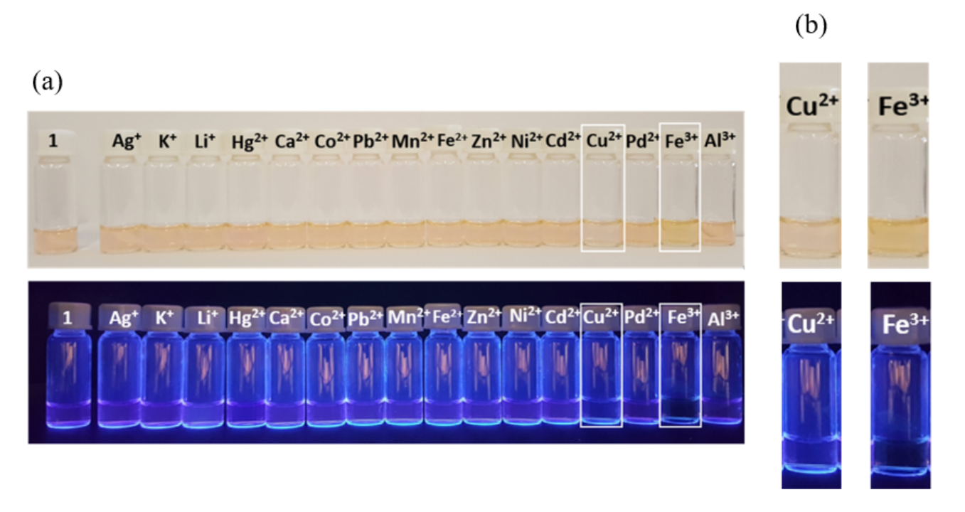
Figure 2. (a) BODIPY derivative 1 solutions in the presence of various cations, in acetonitrile, under natural light ( above ) and UV radiation at \lambda_{max} = 365 nm ( below ); ( b ) expansion to highlight the color and fluorescence intensity changes in the presence of Cu<sup>2+</sup> and Fe<sup>3+</sup>.

A preliminary chemosensing study of BODIPY derivative 1 was performed in acetonitrile solution (1.0 \times 10^{-5} \, \text{M}) with various cations of interest, also in acetonitrile solution (1.0 \times 10^{-2} \, \text{M}) . The study was started by adding 50 equivalents of the solution of each cation to the compound's solution. It was observed that the BODIPY derivative showed a loss of color intensity after interaction with Cu^{2+} and intensification of orange coloration after interaction with Fe^{3+} . As for the fluorimetric behavior, the compound showed a loss of fluorescence in the presence of Cu^{2+} , and a more intense quenching was observed in the presence of Fe^{3+} (Figure 2).