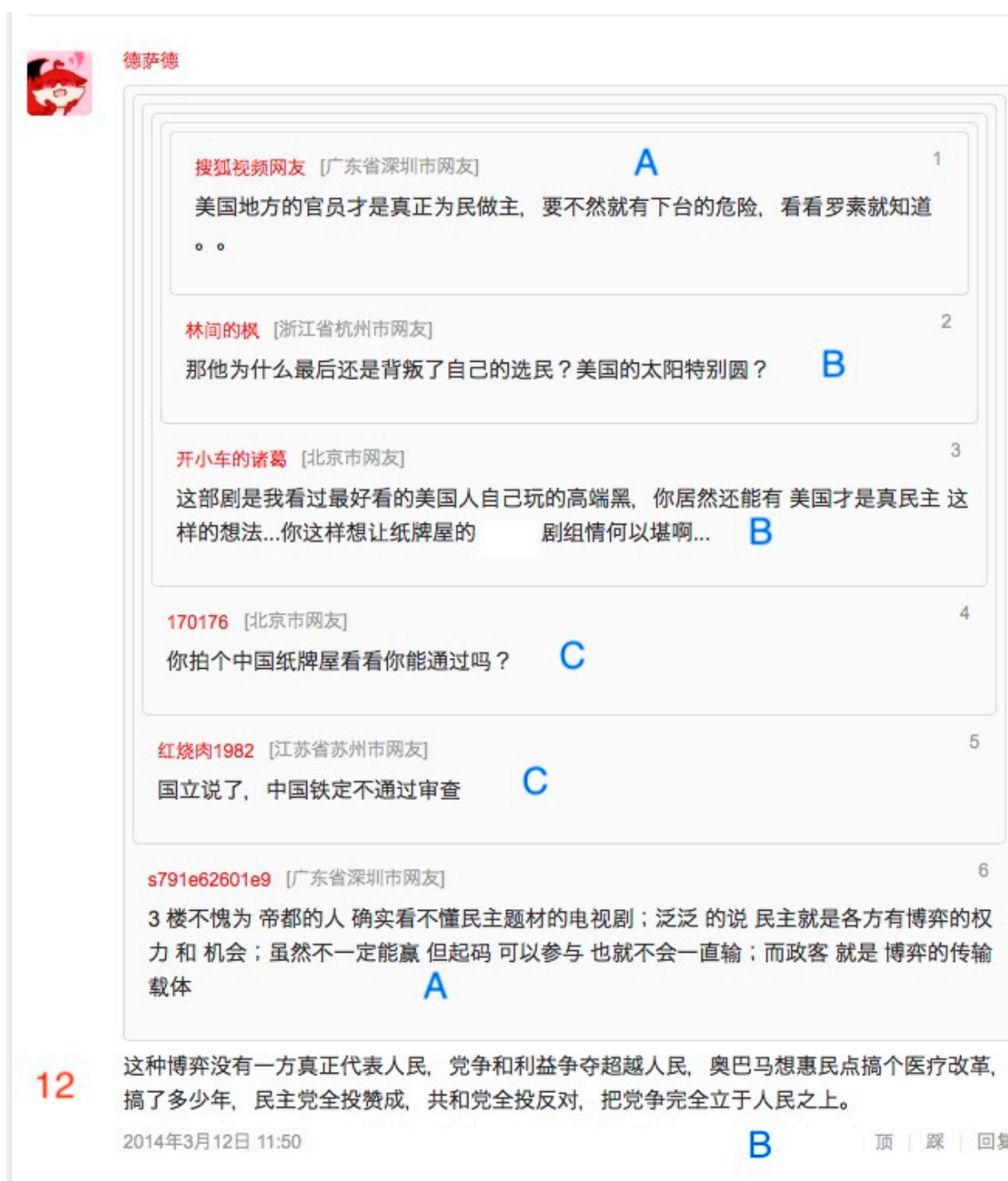
Figure 2. Screenshot of the Sohu comments. The number “12” means that after counting the seven comments on this screen, the total count of selected comments reaches 12 (each screenshot of selected comments has an accumulated case count); the researcher also marked the theme of each comment: A = Theme #1; B = Theme #2; C = Theme #3.

To keep the researcher’s personal bias to the minimum, the researcher constantly reflected upon whether the data collection and analysis were consistent with the established theoretical framework and criteria. When it was difficult to decide whether a comment met all the criteria, the researcher evaluated the comments over and over before making a decision.