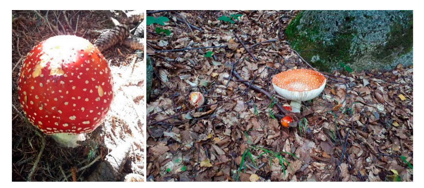
Figure 1. Basidiocarps of A. muscaria observed in the French Prealps (Alpes-de-Haute-Provence, France).