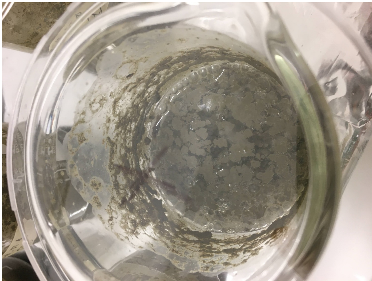
Figure S1. A sample not digested with hydrogen peroxide exhibits flocculation that prevents proper density-based separation.

Remove the saline solution by proceeding with filtration of the supernatant at 3 \mu\text{m} in NC (FILTER 1) and then place the filters in the oven. Perform a second extraction with another 200 ml of brine (wait 24 hours). Continue with the final filtration of the supernatant (FILTER 2). Allow the filters to dry. View the filters under the microscope.