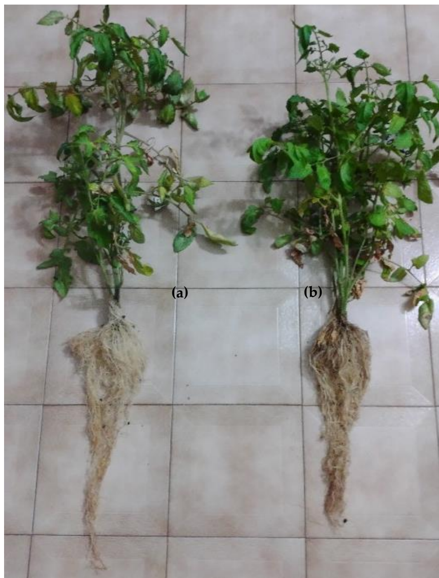
Figure S4. S. lycopersicum plants, Río Grande variety, at harvest time (4 months). (a) planktonic inoculum treatment, (b) biofilm treatment.