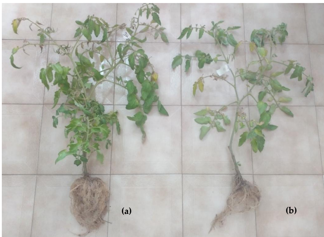
Figure S2. S. lycopersicum plants, Río Grande variety, at harvest time (4 months). (a) planktonic. inoculum treatment, (b) non inoculated treatment.