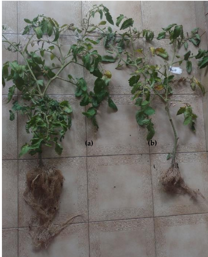
Figure S3. S. lycopersicum plants, Río Grande variety, at harvest time (4 months). (a) biofilm treatment, (b) non inoculated treatment.