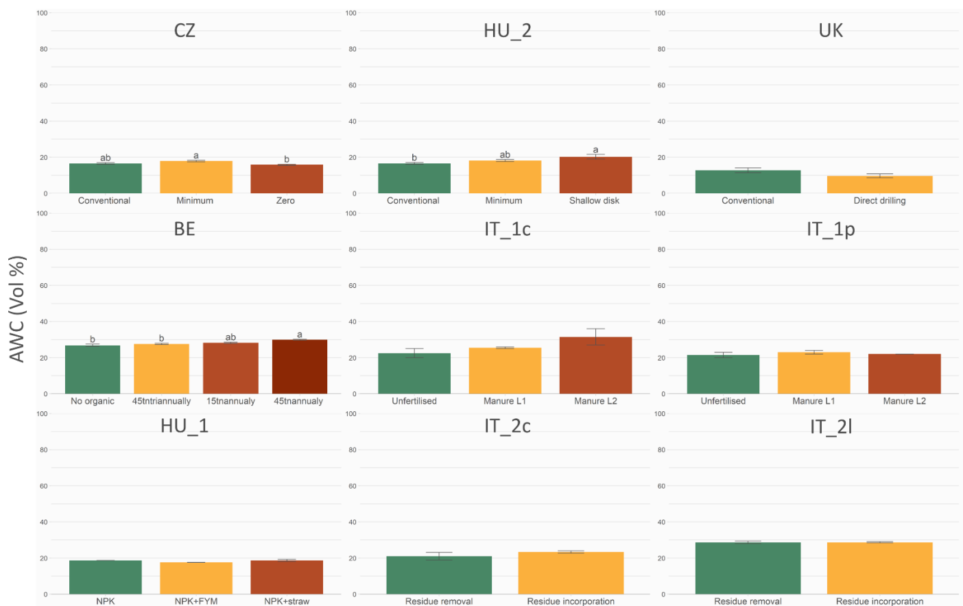
Figure S1: Plant Available Water Content as calculated from the difference between water content at field capacity (pF 2) and water content at wilting point (pF 4.2).

In Figure S1 the plant available water content is presented as calculated from the difference of the water content at field capacity and wilting point. It is observed that the addition of organic materials may increase the AWC, in some cases like in the BE experiment statistically significant, but reduced soil disturbances and zero tillage may decrease the available water for plants as a result of changes in the pore distribution and capillary forces.